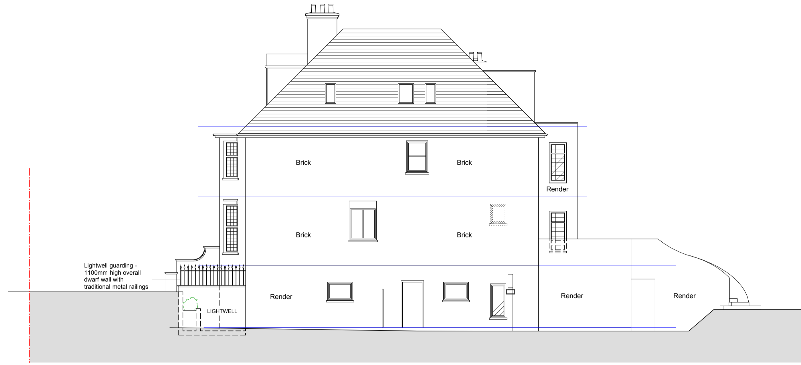
PROPOSED SIDE (NORTH WEST) ELEVATION 1:100