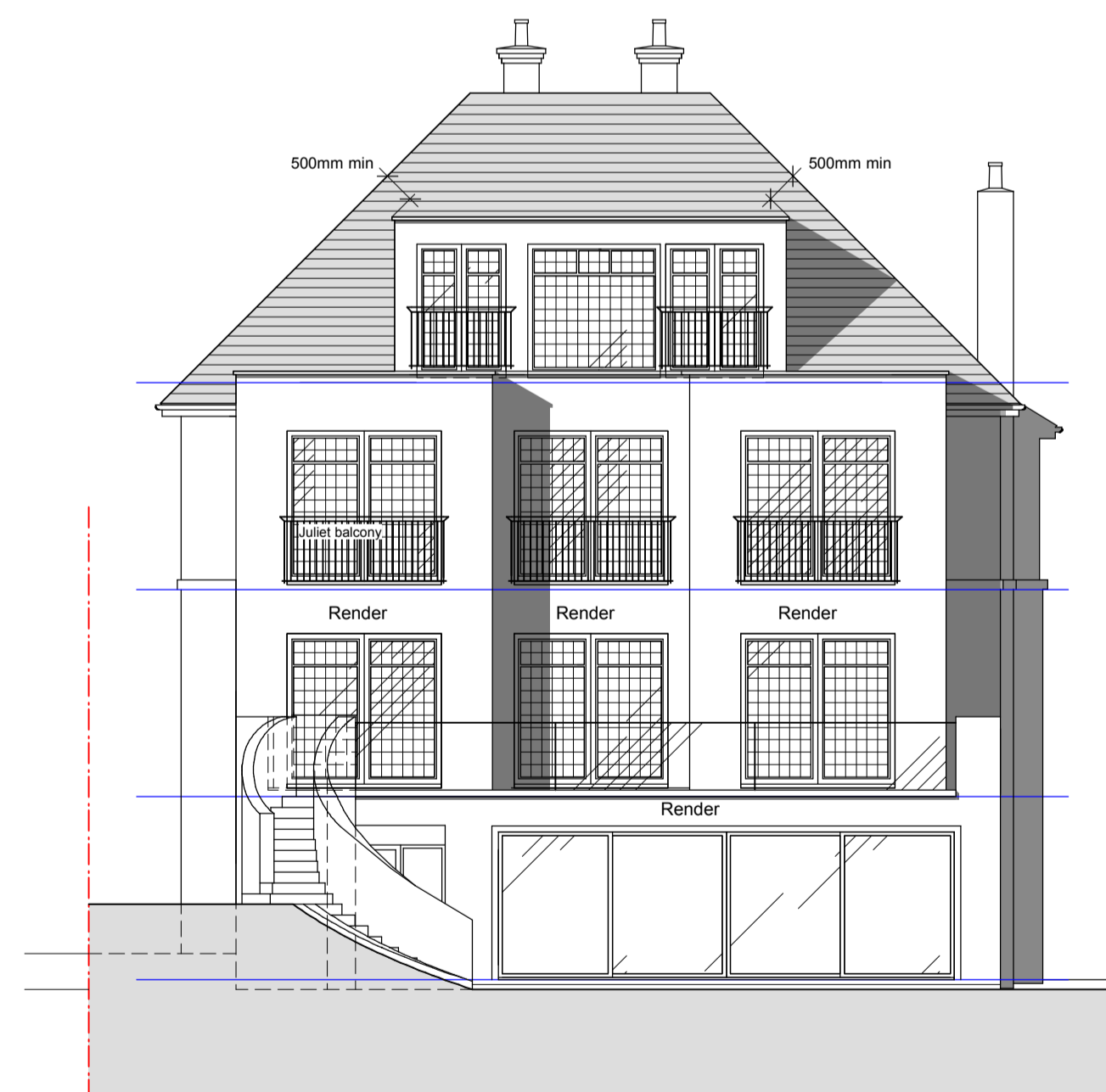
PROPOSED REAR (SOUTH WEST) ELEVATION 1:100