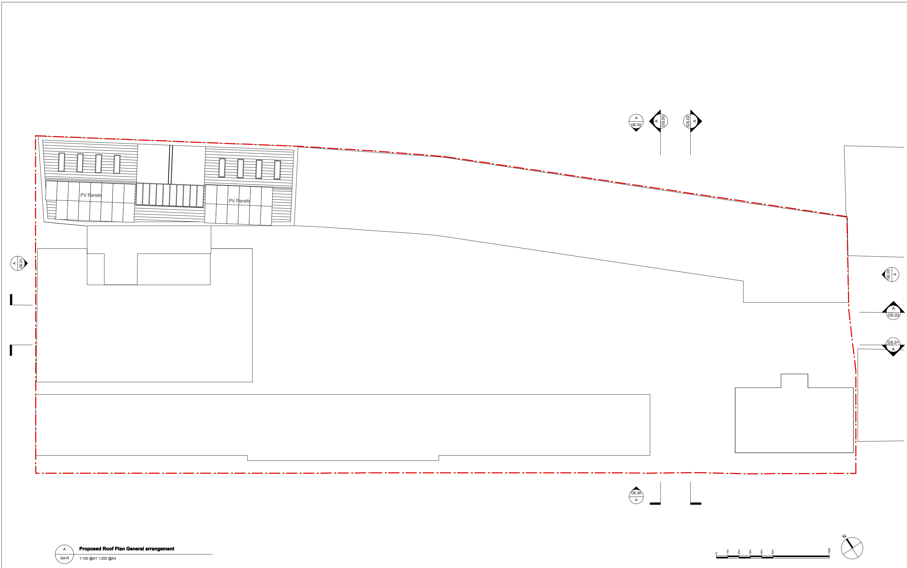
A Proposed Roof Plan General arrangement GAR 1:100 @A1 1:200 @A3