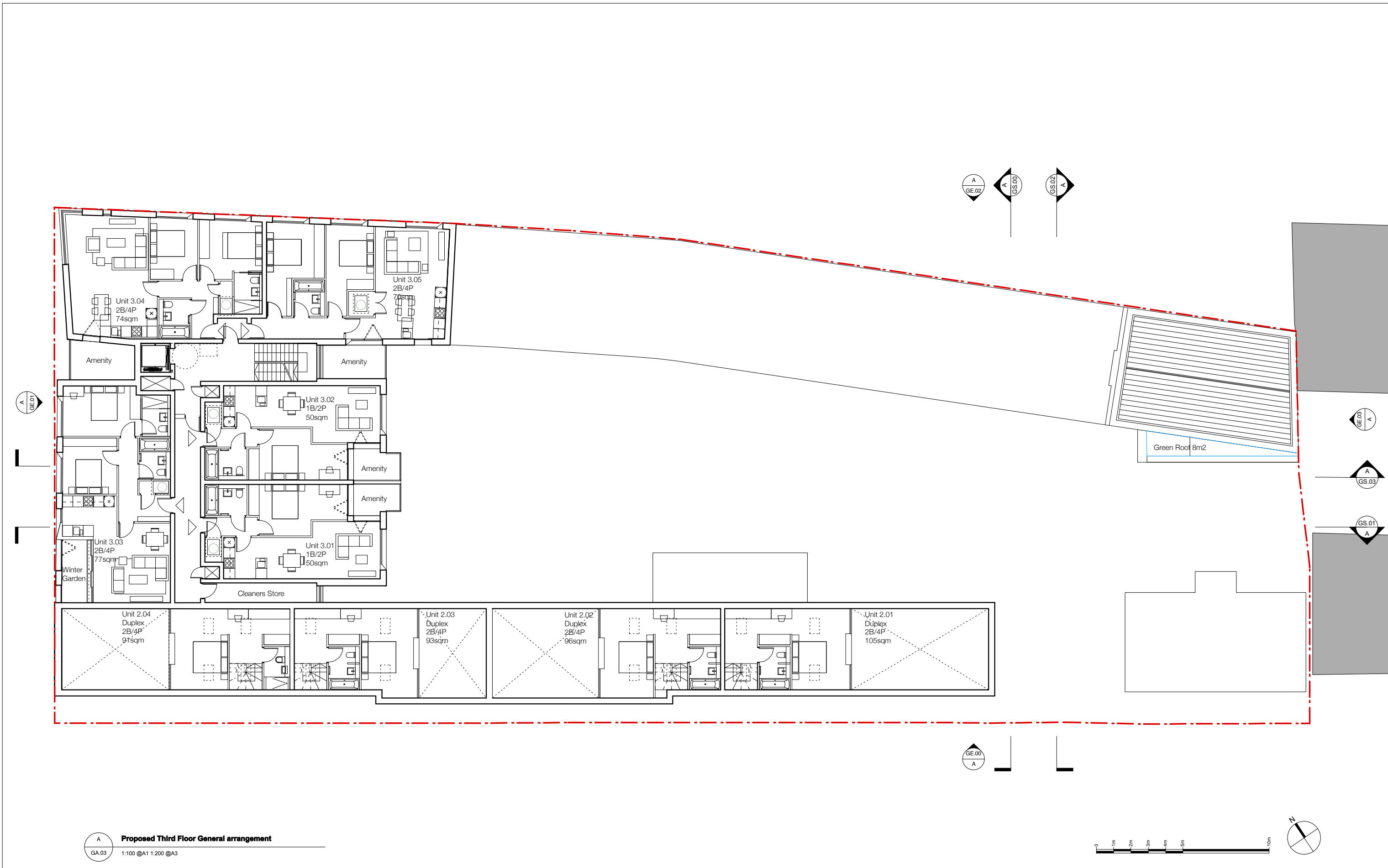
A Proposed Third Floor General arrangement GA.03 1:100 @A1 1:200 @A3