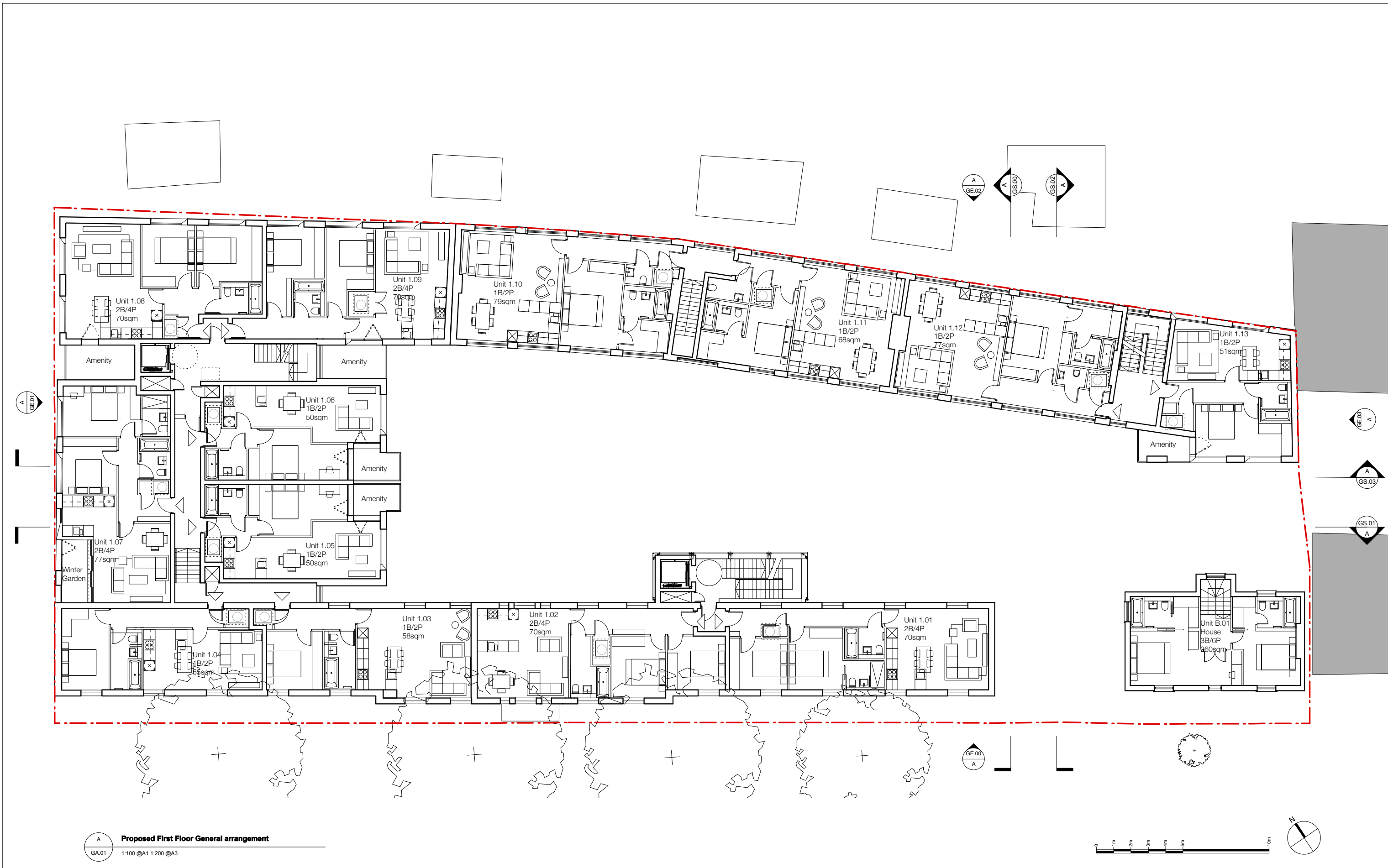
A Proposed First Floor General arrangement GA.01 1:100 @A1 1:200 @A3