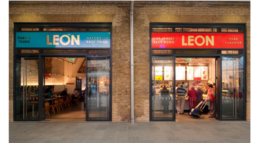
Shopfront inspiration: Gold leaf lettering on coloured glass