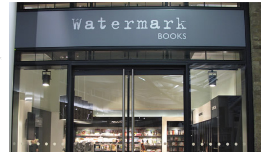
Current unit shopfront