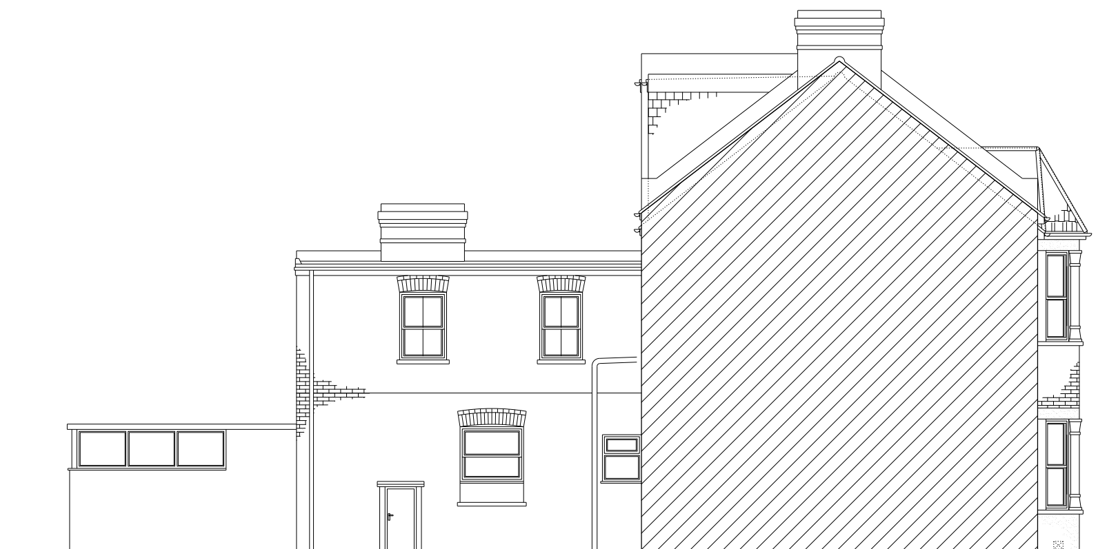
2 side elevation