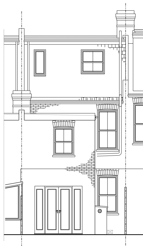
3 rear elevation