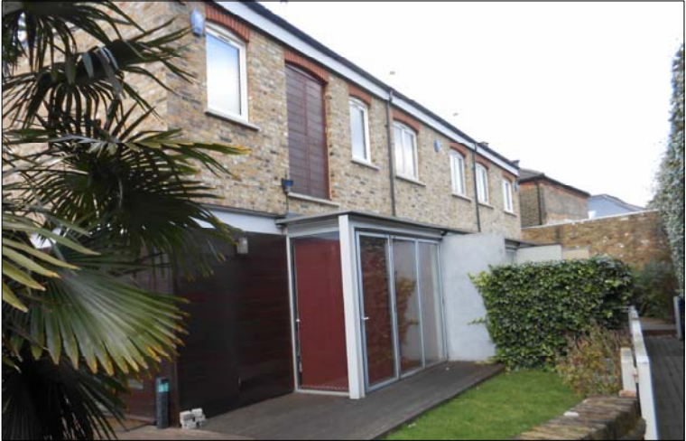
Existing Elevation 2