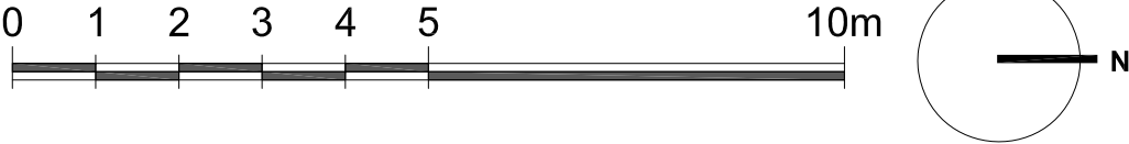
Proposed Elevation 2

The use of this data by the recipient acts as an agreement of the following statements. Do not use this data if you do not agree with any of the following statements:-