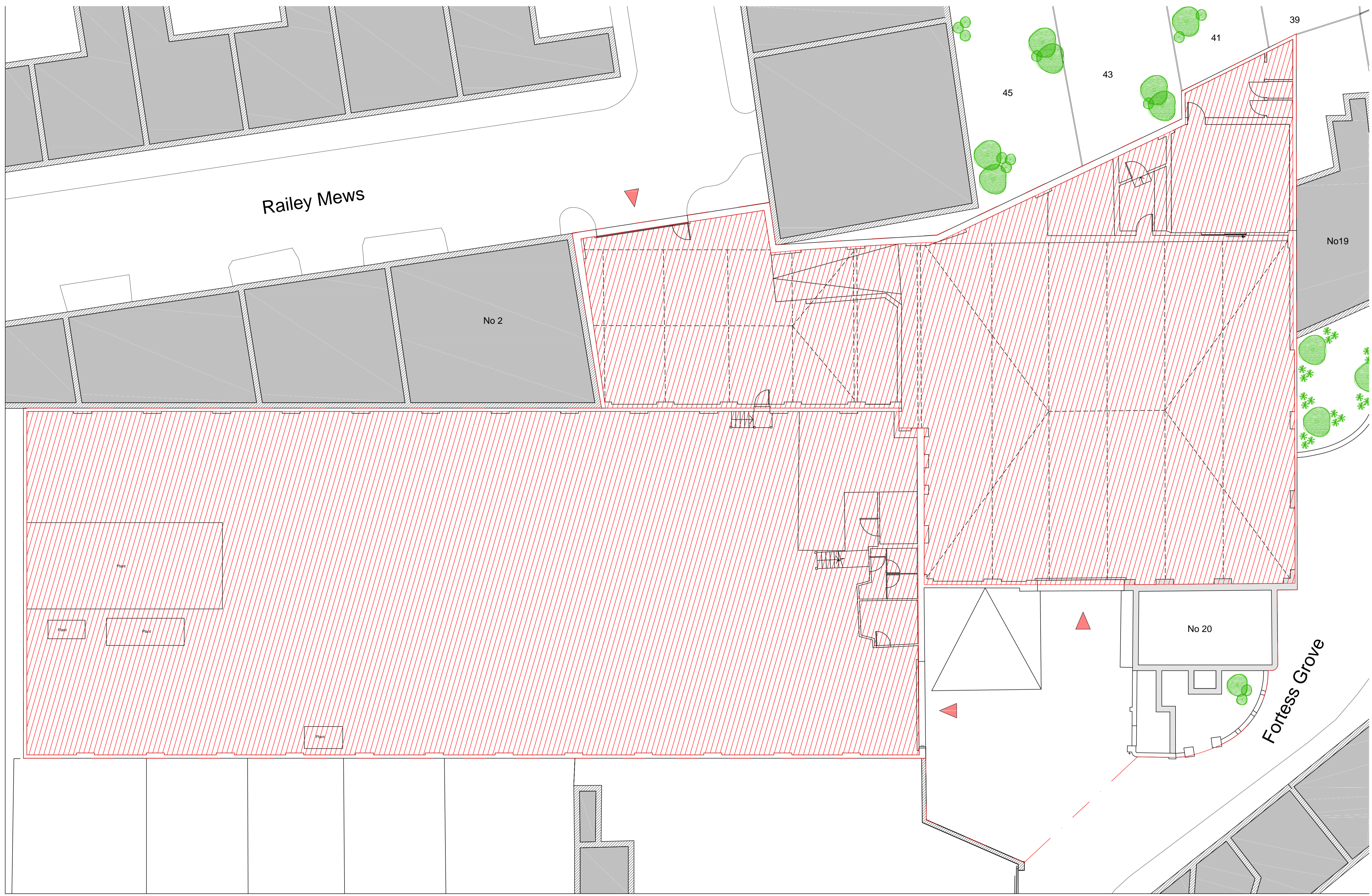
1 Ground Floor Plan 1:100