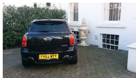
01 View of existing front driveway where excavation will commence