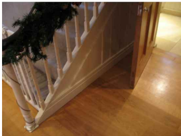
01-02 Existing lower ground floor WC where new staircase will be located.