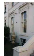
17-18 Existing timber sash windows on front elevation to be boarded and protected during construction phase