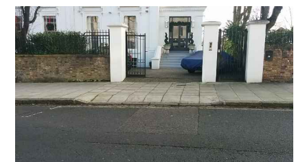
12-14 Existing front boundary wall with fence, column and front gate to be protected

18 Existing window to be boarded and protected.