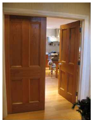
03 Internal doors to be protected