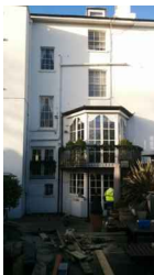
09-11 Bay windows and french doors to be protected