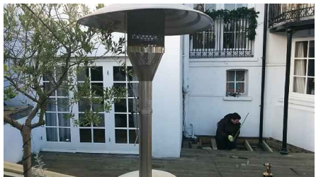
07-08 Existing bifolding doors and WC window to be protected