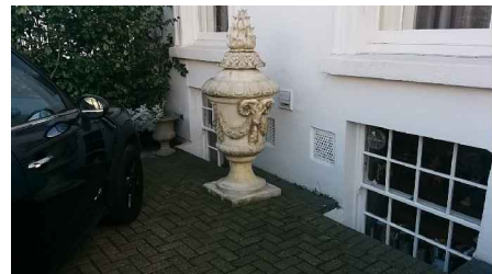
01-02 Existing windows to be boarded and protected during construction works