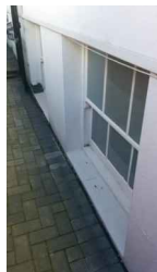
04-06 Low level windows to be protected