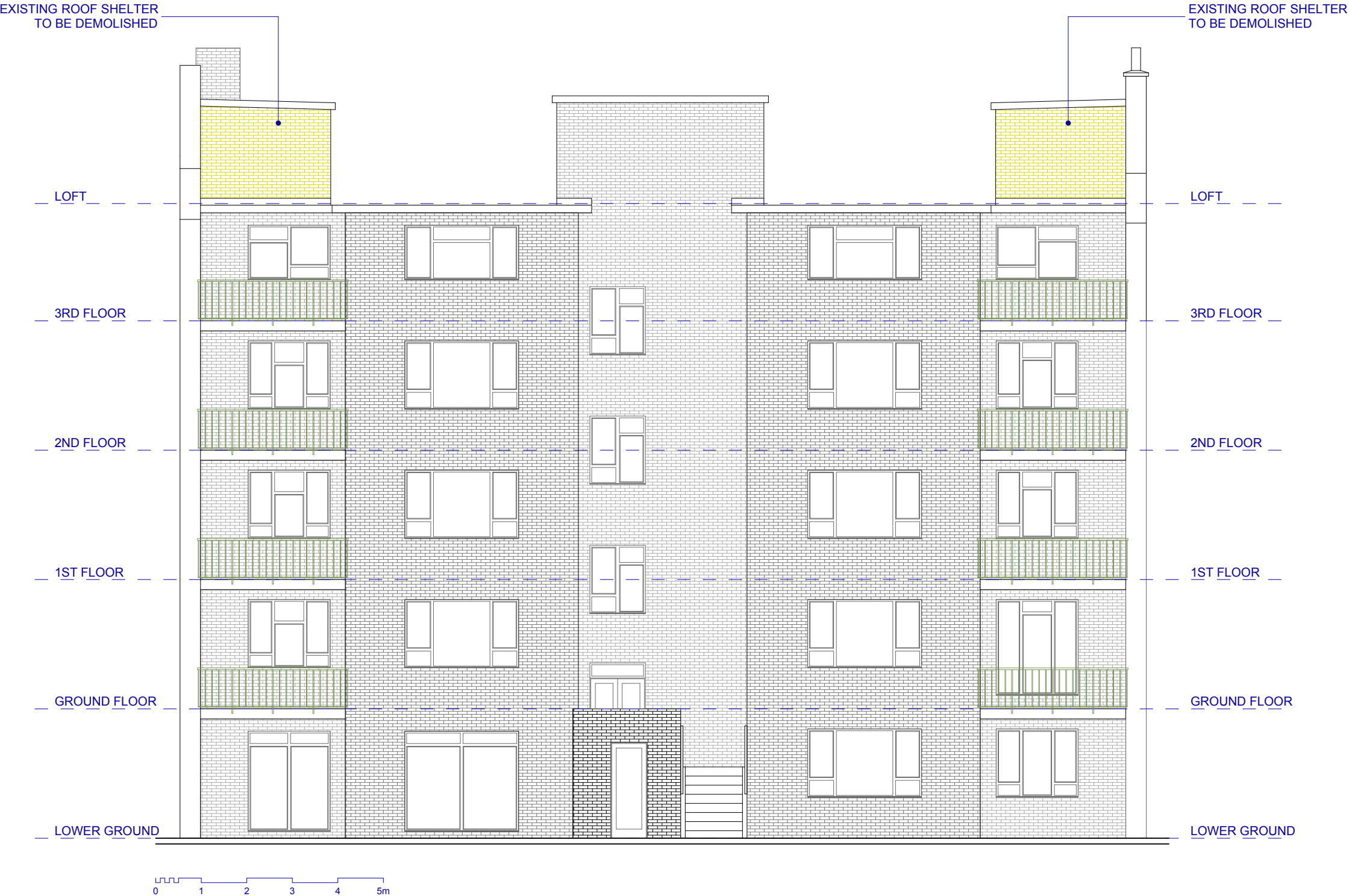
South Elevation as Existing

drawing no: BSP 01.04 scale @A3: 1:100 project no: 1508 date: 20/07/2015 drawn by / checked by: OG / OG