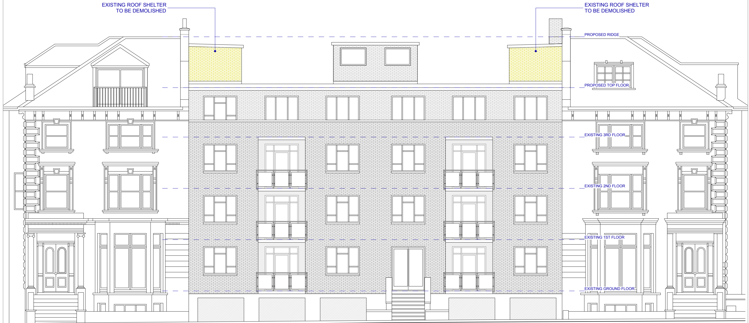
North Elevation as Existing

This scheme is subject to Planning and Building Control Consent and all other necessary permissions.