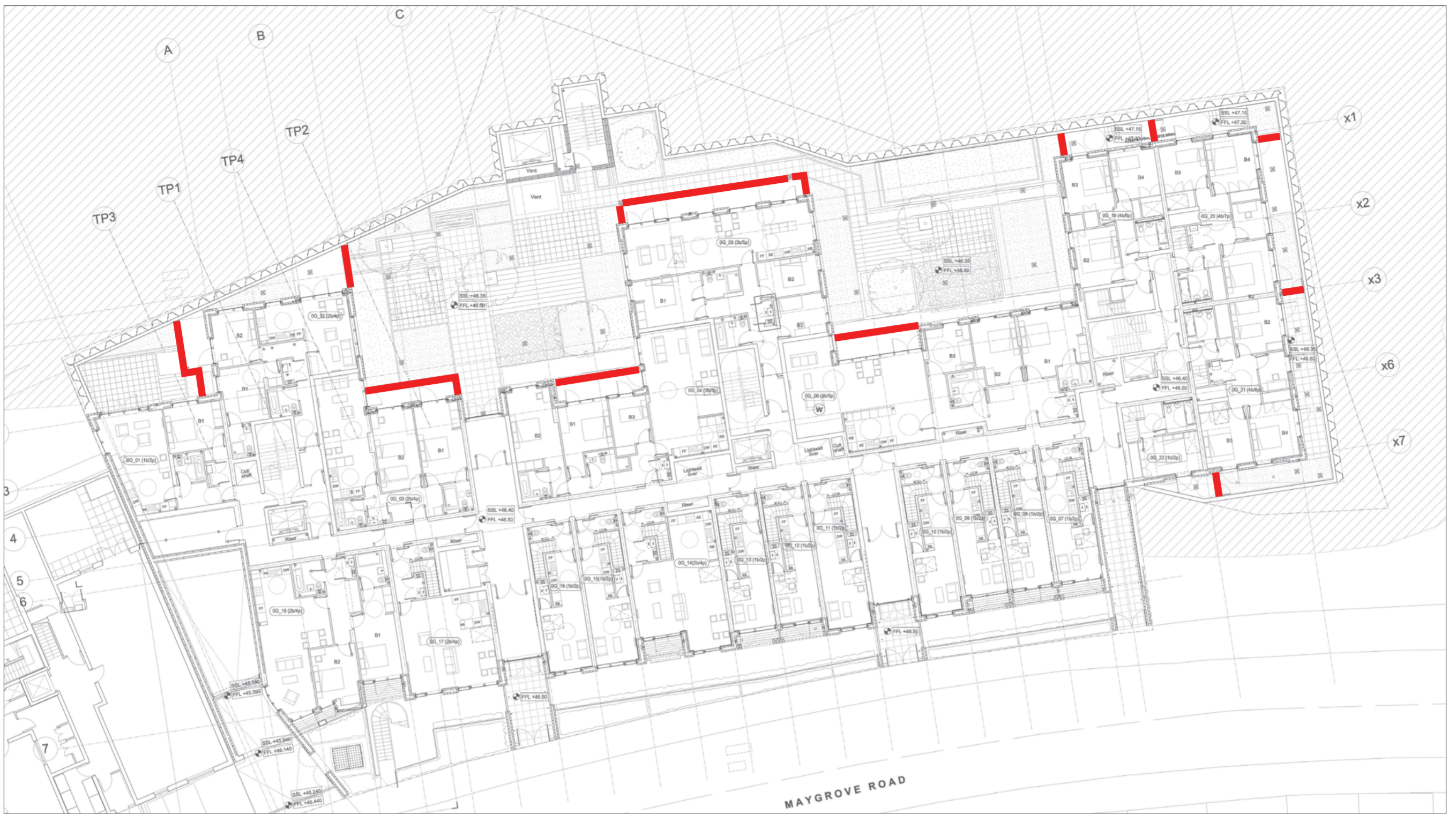
Plan showing location of Privacy screening at Ground Floor