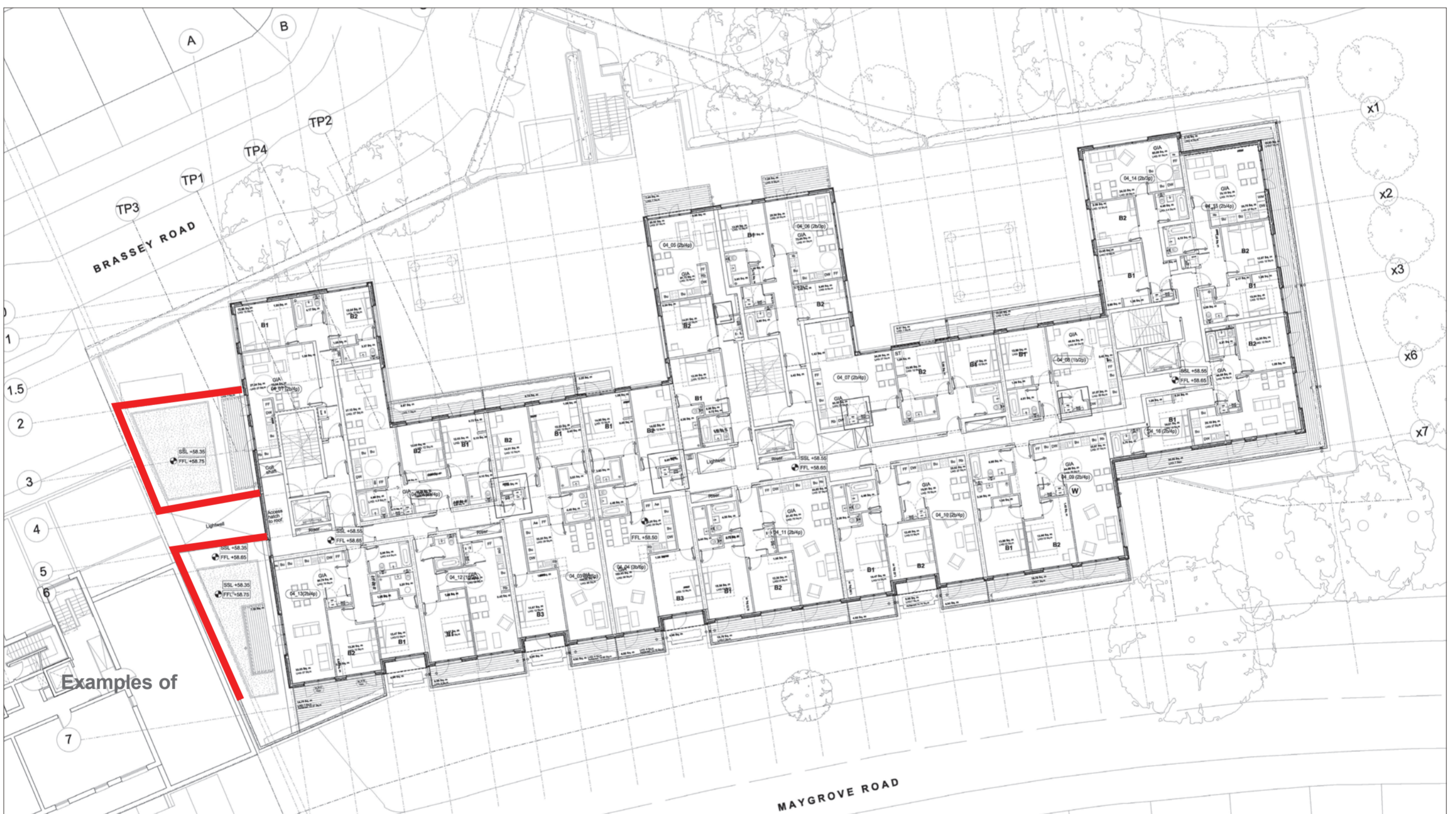
Plan showing location of Privacy screening at Penthouse Level Terrace adjacent To No. 59 Maygrove Road