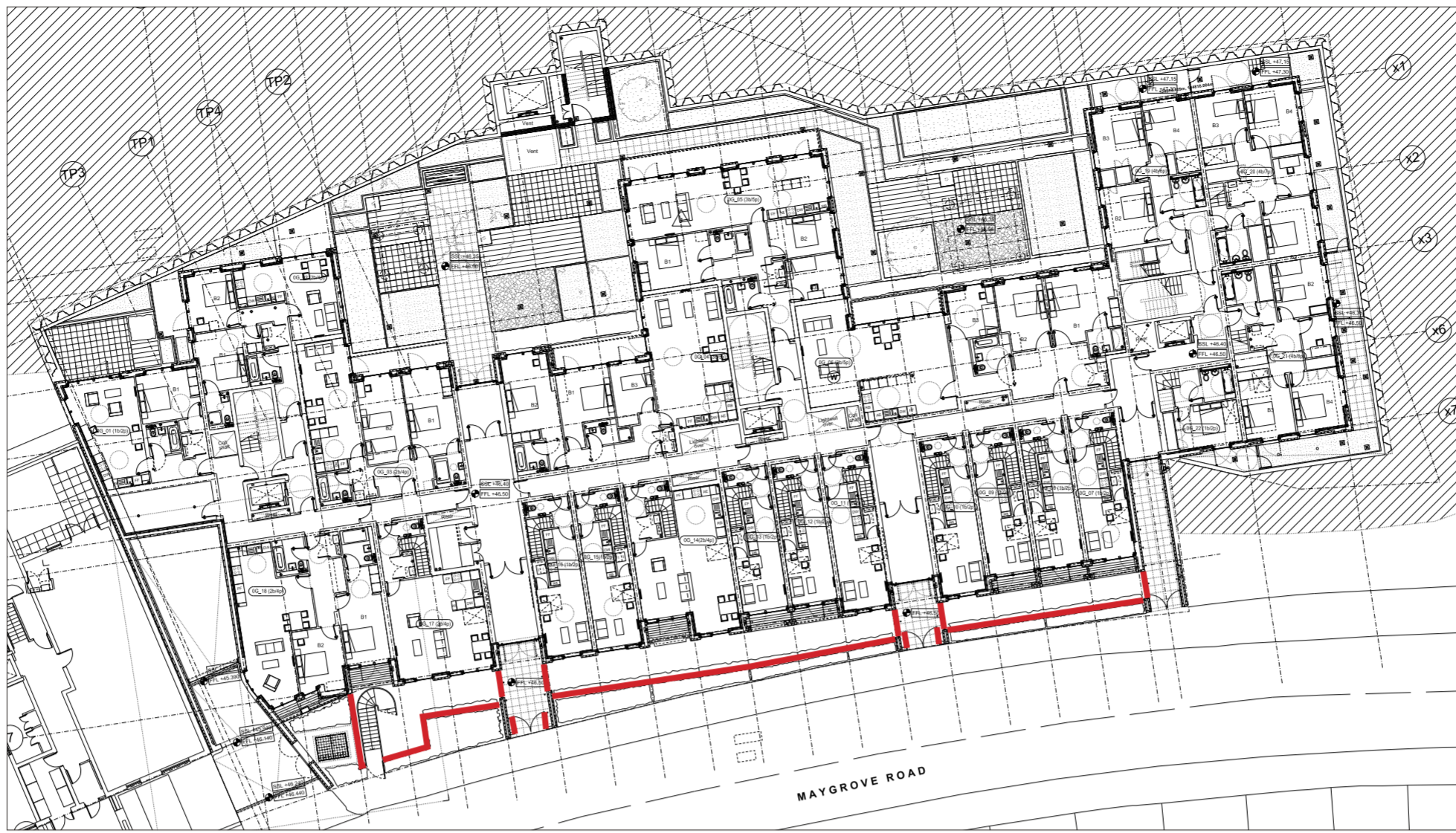
Ground Floor Plan showing location of proposed railings