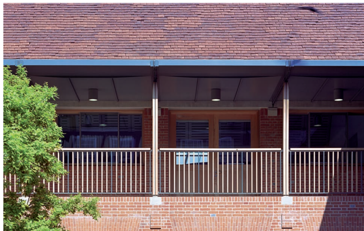
Similar Railings used at our project Henrietta Barnet School in Hampstead Garden Suburb,