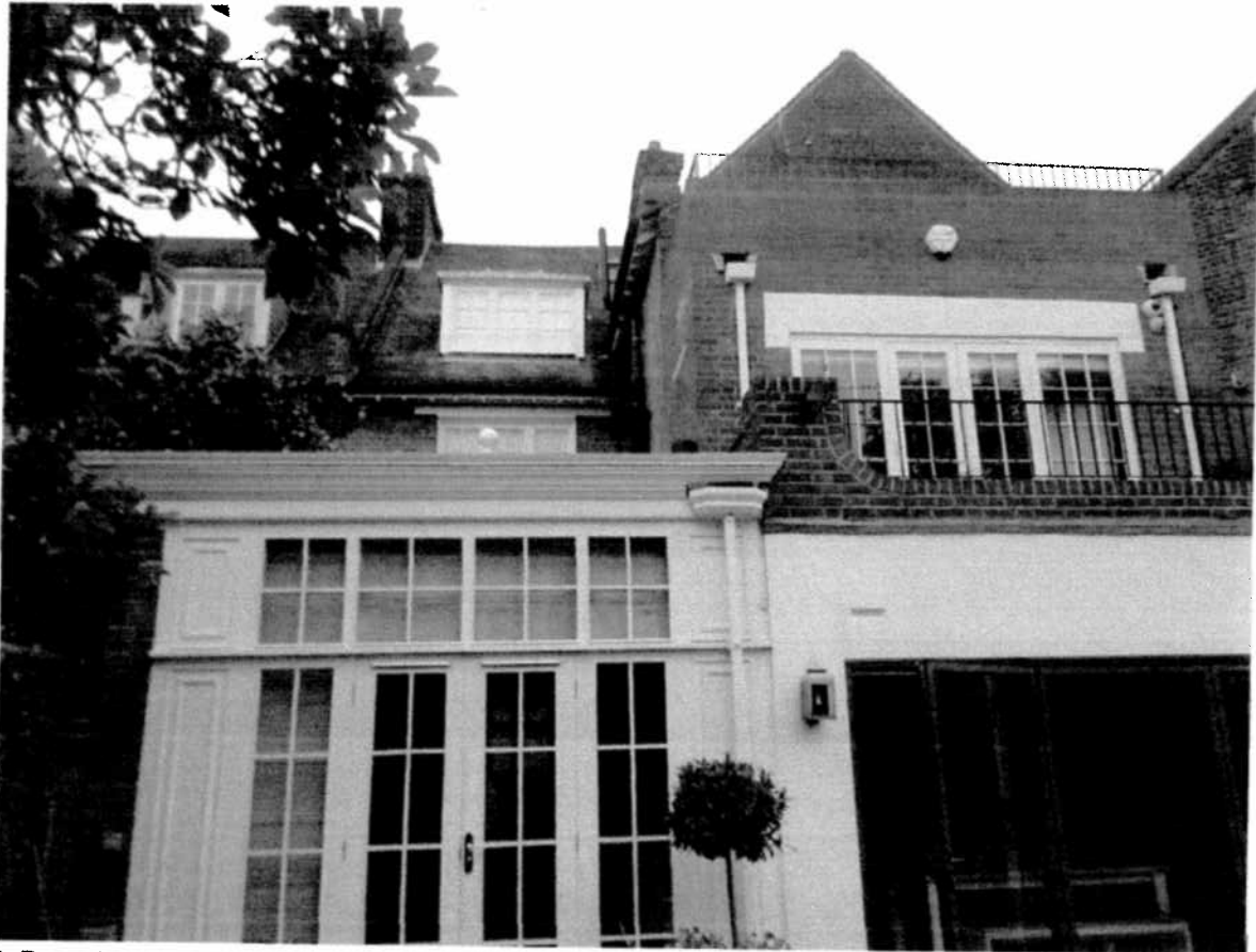
3. Rear elevation of number 34 showing existing roof terraces to first floor study and second floor bedroom