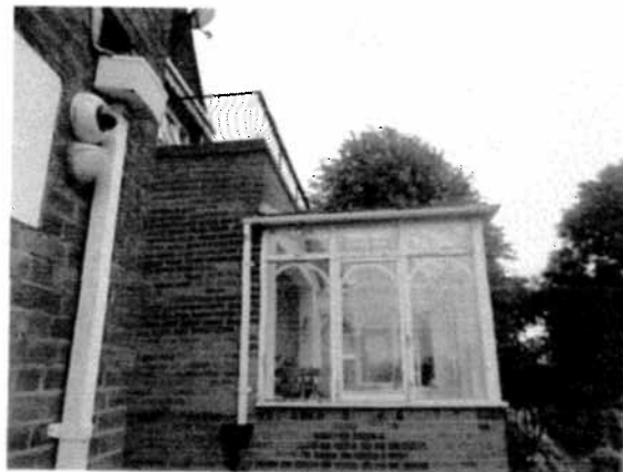
5. Side elevation of first floor conservatory at number 36