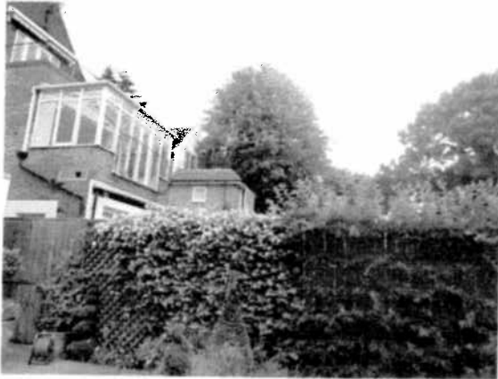
4. Existing conservatory extension at first floor of 36 and roof terrace at second floor level. Extension to First floor rear of 38 also visible.