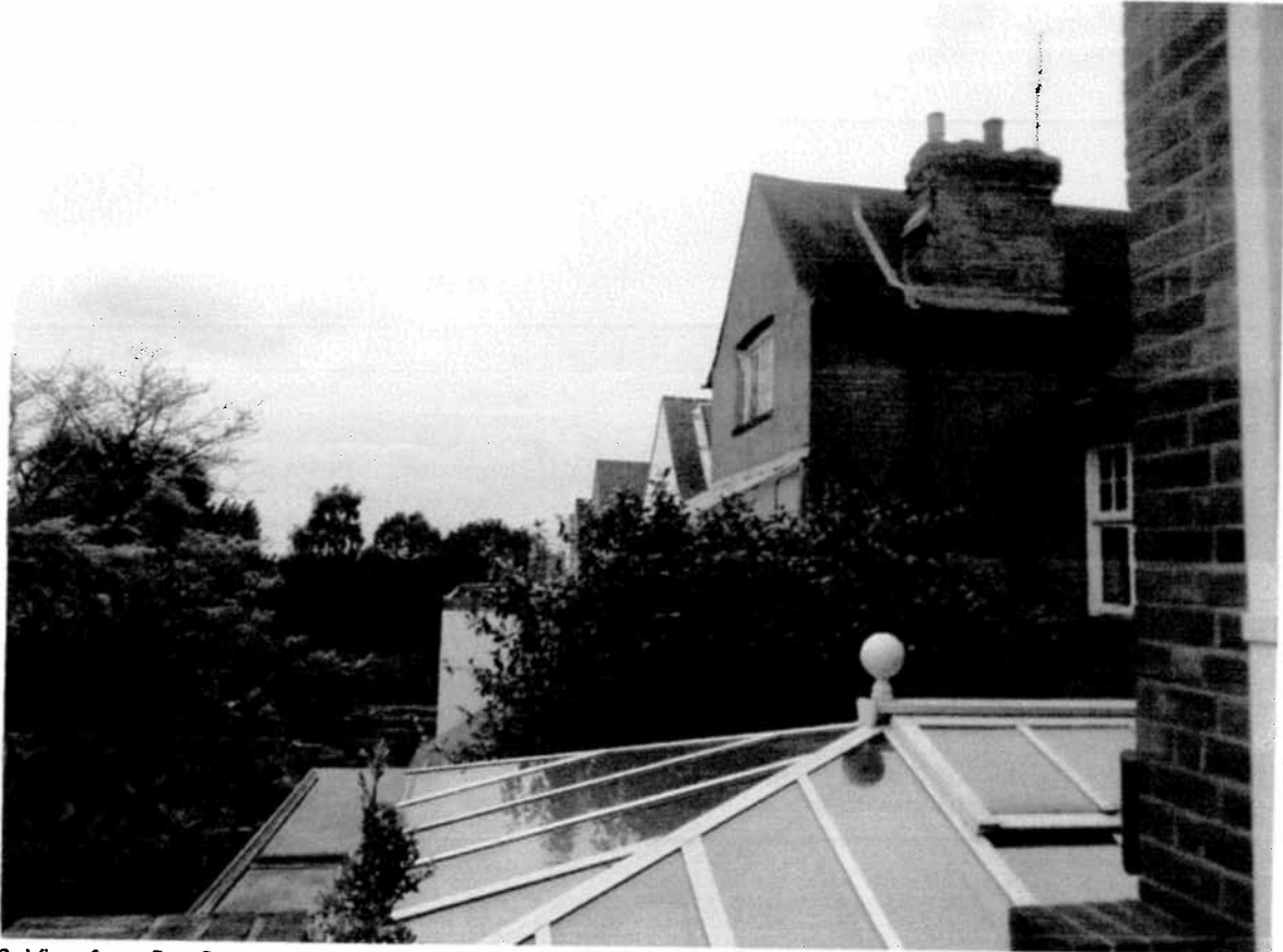
6. View from first floor terrace to number 34 showing roof of conservatory to rear of 34, first floor conservatory to rear of number 32 and modern two storey extension to rear of number 30