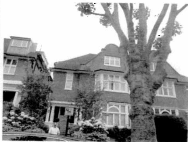
2. Front elevation of number 34 in relation to 36 No alterations proposed