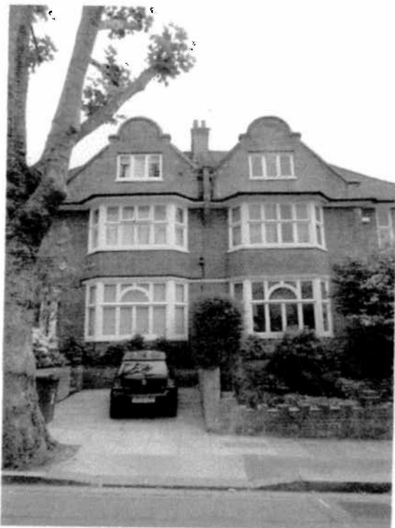
1. Front elevation of number 34 and 32 No alterations proposed

The existing mature landscaping to the side and rear of the property is not affected in any way by the proposed alterations.