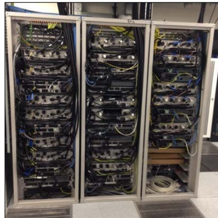
Example Photo of proposed Rack Layout

New 900, 1800, LTE800 and LTE2600 to be Located Within New 42" Rack (Two Sectors)