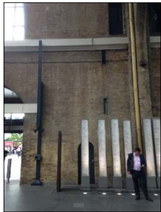
EXISTING SITE PHOTOGRAPH