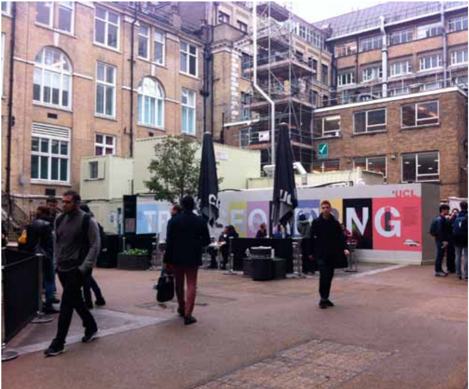
Site looking towards Anatomy