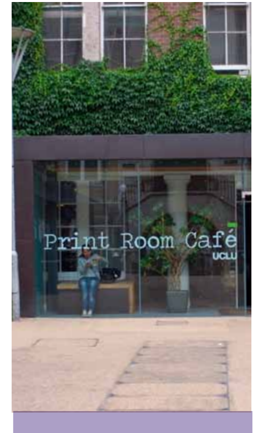
SU Print Room Cafe