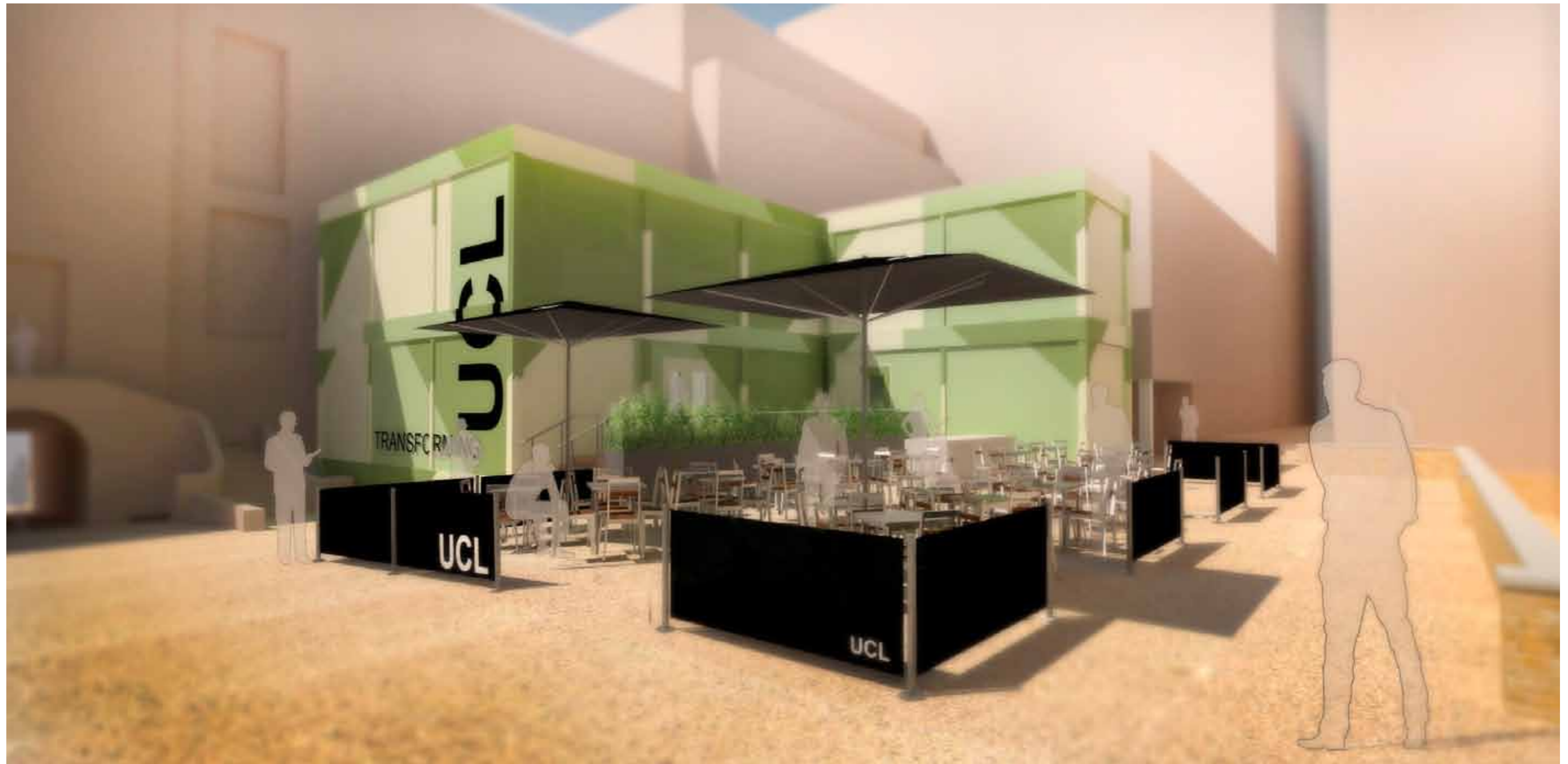
Proposed Supergraphic vinyl 'Wrap' design indicative - to be developed by UCL graphic design