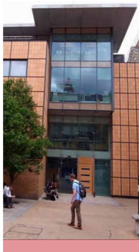
Arts & Humanities