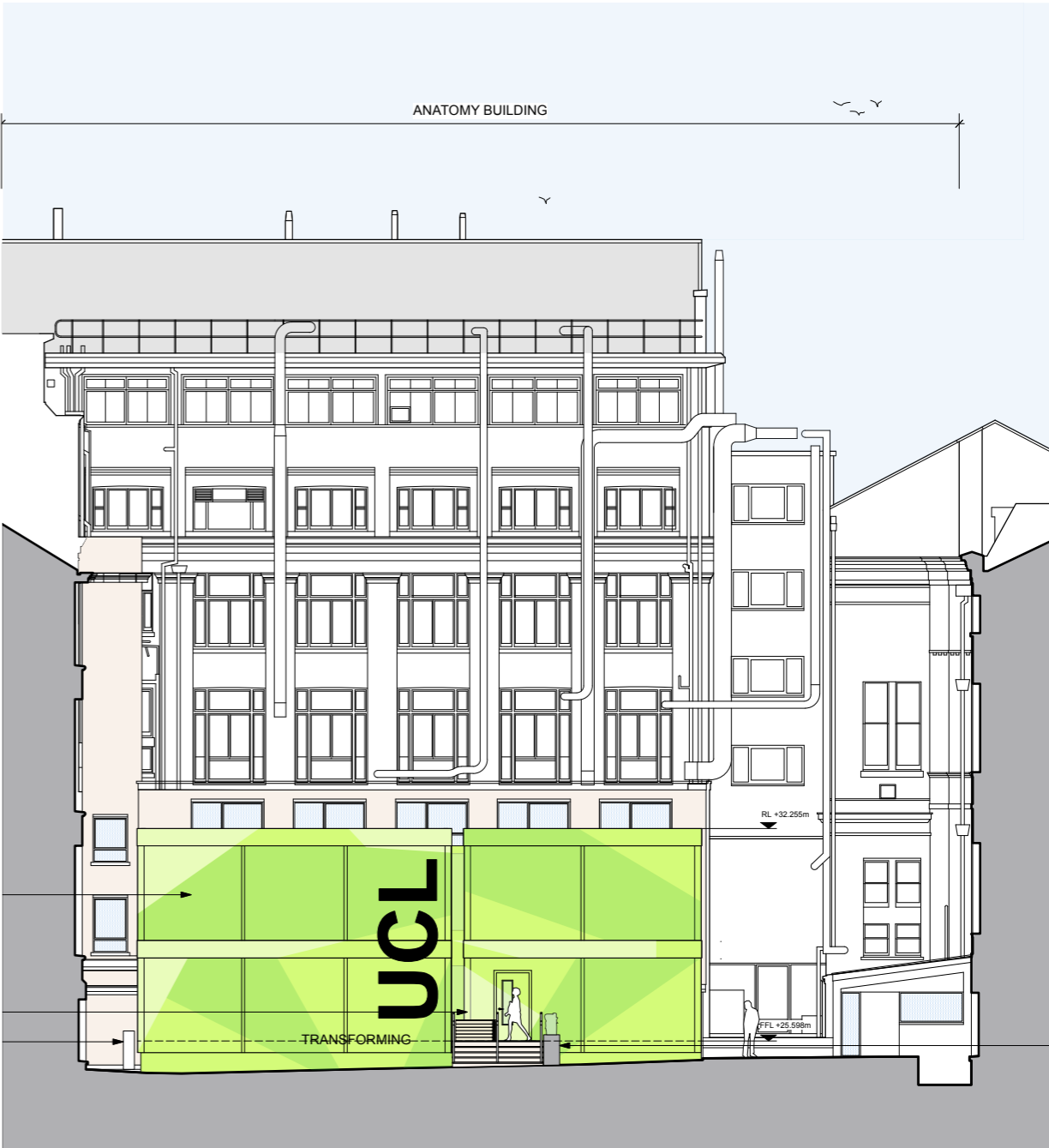
Proposed Supergraphic vinyl ‘Wrap’ design indicative - to be developed by UCL graphic design