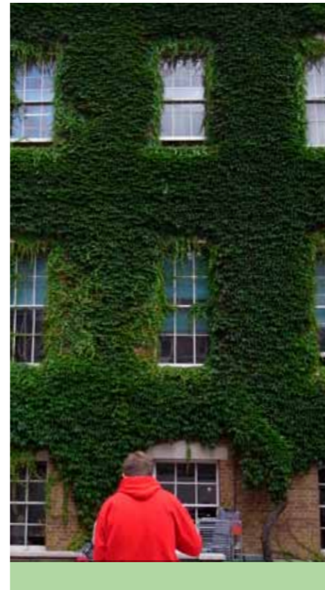
Wilkins South Wing