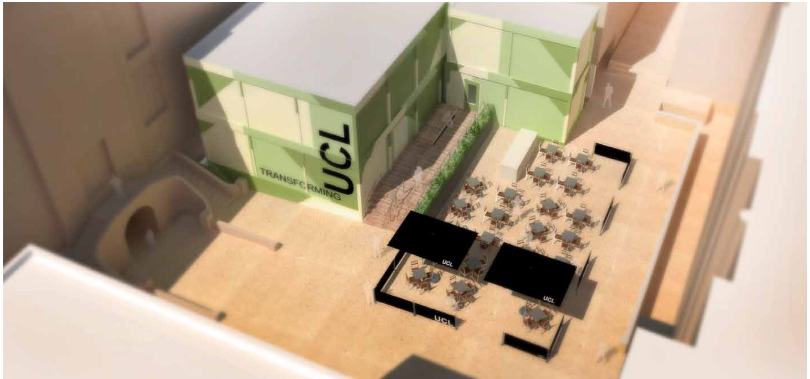
Proposed Supergraphic vinyl 'Wrap' design indicative - to be developed by UCL graphic design