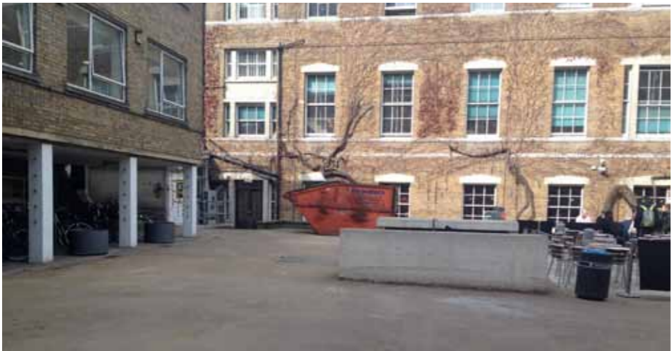
Site looking towards South Wing