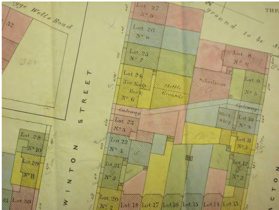
A detail from a plan attached to 1833 sales particulars of the Swinton Estate showing two front areas either side of a central entrance of Lot 24 The Kings Head (Camden Archives ref.BRA1605/5)