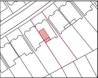
Site Plan - Scale 1:1000 @ A1

NOTES DO NOT SCALE FROM THIS DRAWING. ALL DIMENSIONS TO BE CHECKED ON SITE. ALL OMISSIONS AND DISCREPANCIES TO BE REPORTED TO THE ARCHITECT IMMEDIATELY.