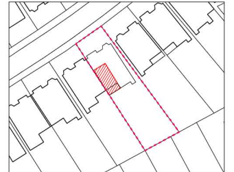
Site Plan - Scale 1:1000 @ A1

NOTES DO NOT SCALE FROM THIS DRAWING. ALL DIMENSIONS TO BE CHECKED ON SITE. ALL OMISSIONS AND DISCREPANCIES TO BE REPORTED TO THE ARCHITECT IMMEDIATELY.