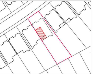
Site Plan - Scale 1:1000 @ A1

NOTES DO NOT SCALE FROM THIS DRAWING. ALL DIMENSIONS TO BE CHECKED ON SITE. ALL OMISSIONS AND DISCREPANCIES TO BE REPORTED TO THE ARCHITECT IMMEDIATELY.