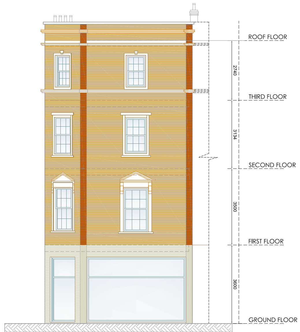
(ELE) EXISTING FRONT ELEVATION Scale: 1:100 A3