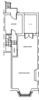
PROPOSED RAISED GROUND FLOOR PLAN

NOTES: 1. All dimensions are in millimetres unless otherwise stated. 2. All work shall be in accordance with the Building Regulations 2010. 3. All work shall be in accordance with the relevant British Standards. 4. All work shall be in accordance with the relevant local authority requirements. 5. All work shall be in accordance with the relevant professional requirements. 6. All work shall be in accordance with the relevant health and safety requirements. 7. All work shall be in accordance with the relevant environmental requirements. 8. All work shall be in accordance with the relevant fire safety requirements. 9. All work shall be in accordance with the relevant accessibility requirements. 10. All work shall be in accordance with the relevant sustainability requirements.