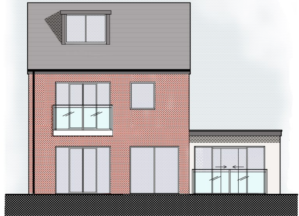
[02] Rear Elevation as seen from Ground level 1:100