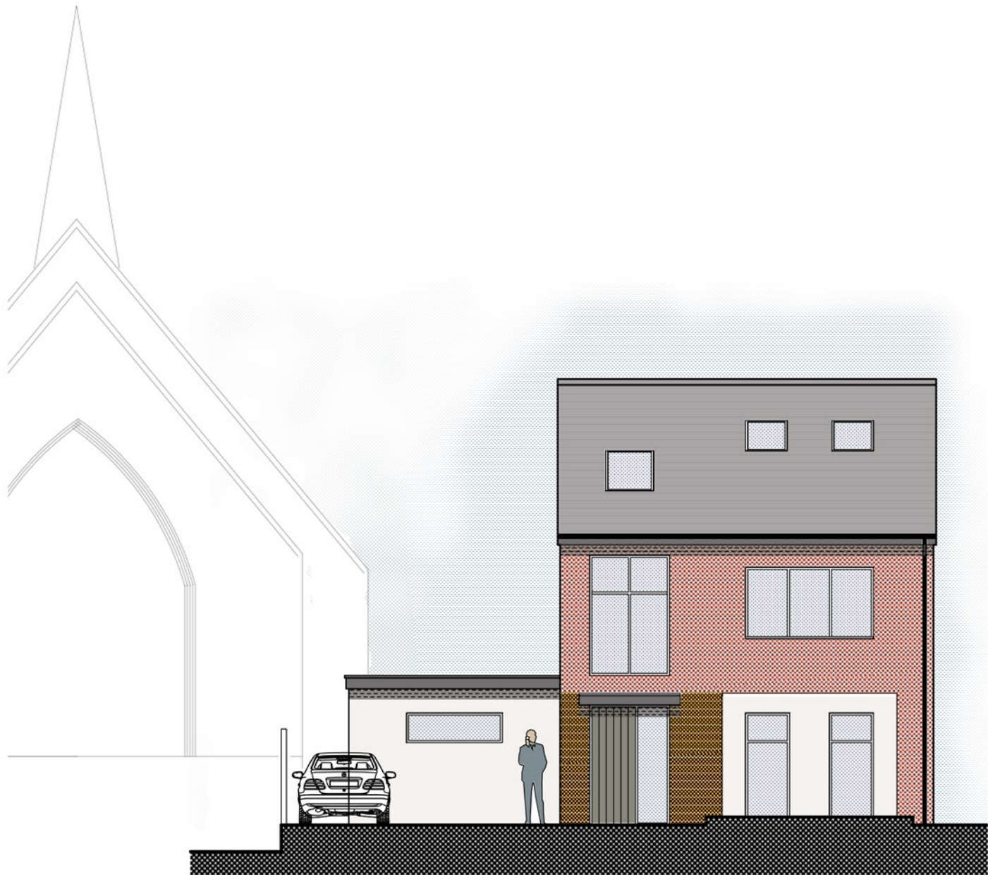
[01] Front Elevation as seen from Ground Level 1:100