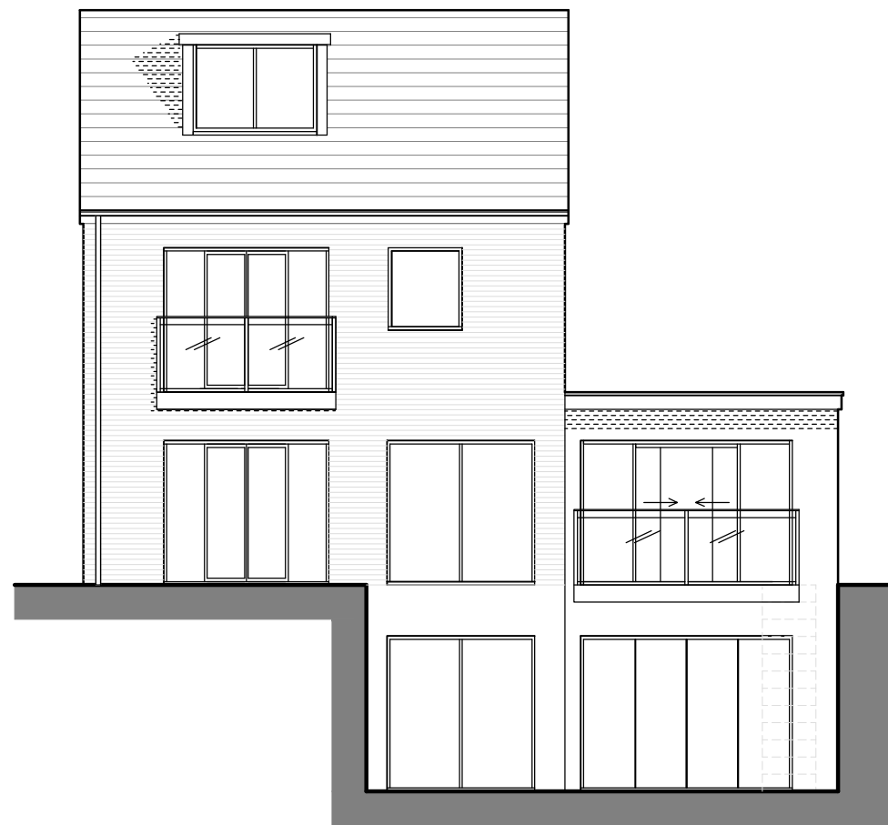
[01] Proposed Rear Elevation 1:100