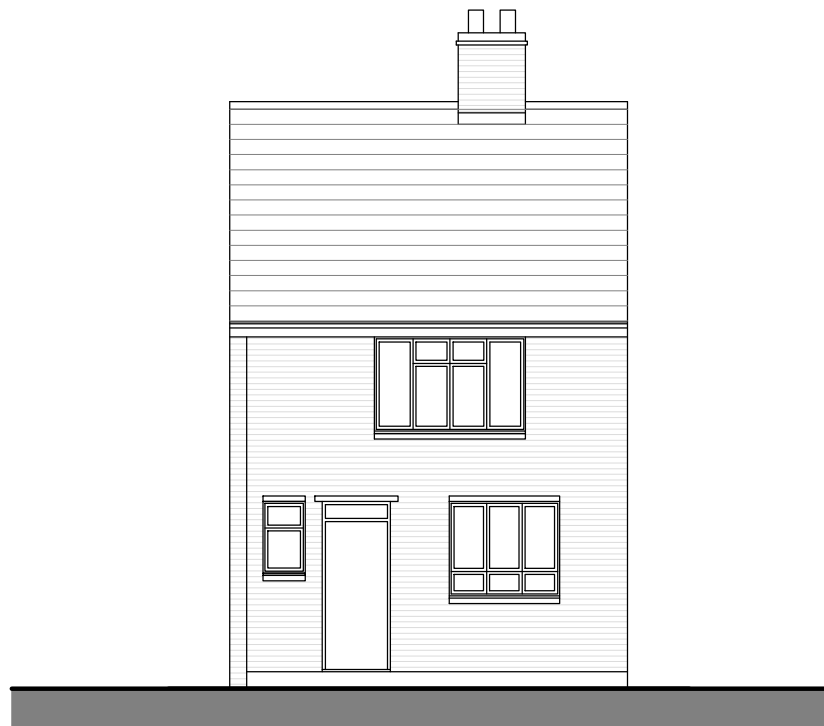
[01] Existing Front Elevation 1:100