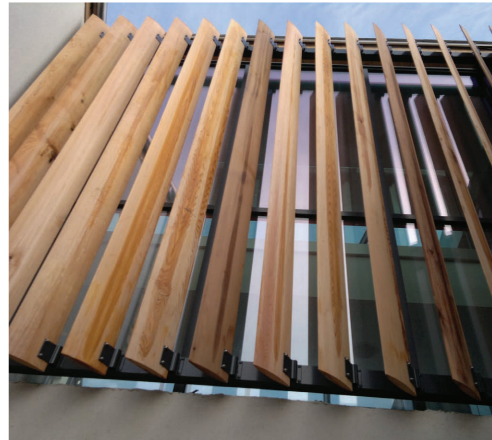
EXAMPLE OF TIMBER LOUVERS FOR PRIVACY - EXTERNAL VIEW