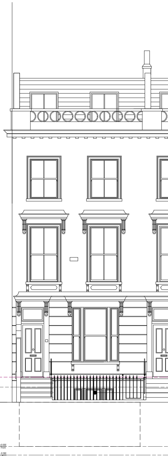
01 Proposed Front Elevation Scale 1:100@A3