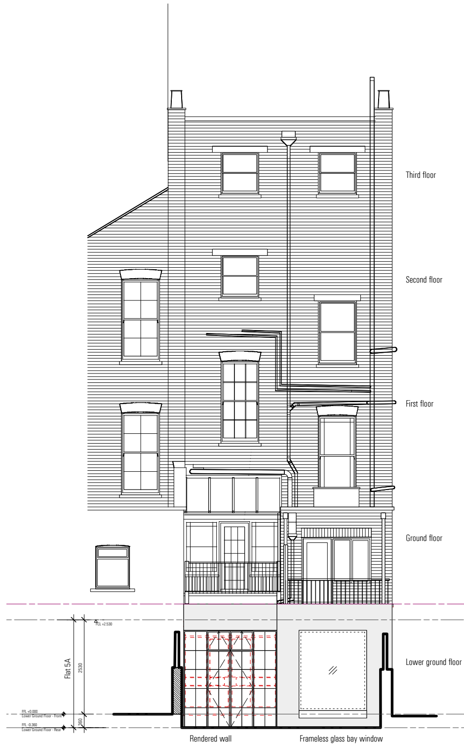
02 Proposed Rear Elevation Scale 1:100@A3