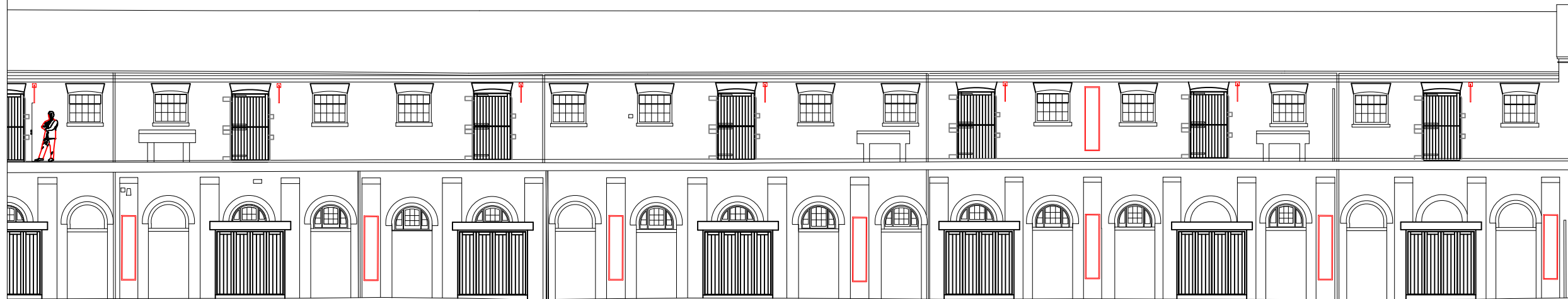
TENTATIVE SIGNAGE POSITION (variable) SOUTH ELEVATION

ONLY LETTERING ATTACHED TO MORTAR ALLOWED ABOVE THIS LINE