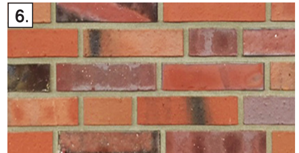
Brick type 2: To projecting bays on both Belsize Road and Railway elevations, Blocks A-E : STP -EF-8/Schmelzbrand