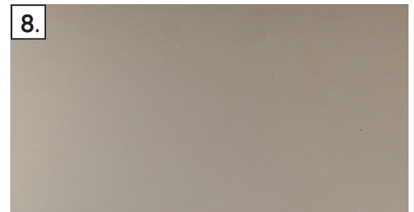
Canopies/Metal Panelling: Bronze Effect anodised aluminium : United Anodisers Ltd Anolok 543