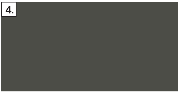
Windows/door frames/balustrades: Swatch sample RAL 7022