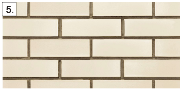
White glazed brick to Landmark Building Recessed balconies : Ibstock white / WT-07

PL 001 24 July 2015 15-029 Abbey Area Phase 1 3D Perspective Showing Material Samples - For discharge of condition 26