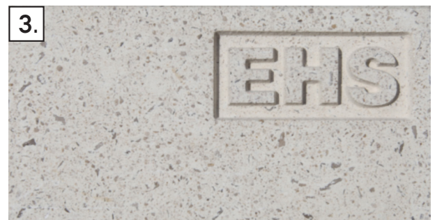
Reconstituted stone: EH Smith Portland Medium Etch