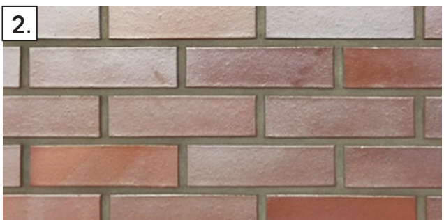
Brick Type 1, to Landmark Building and spine of lower blocks : Janinhoff Blue/blue red/8C