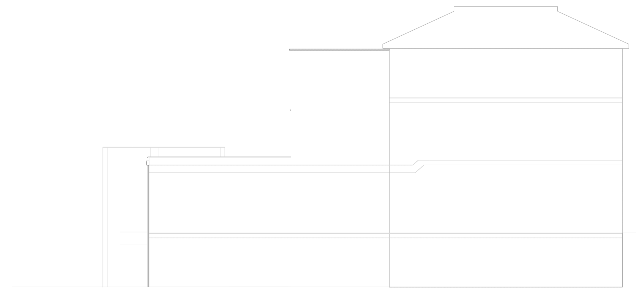
PROPOSED ELEVATION A