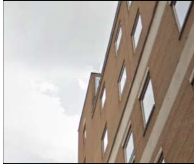
Close-up of proposed riser, which will be utilised for the A3 ventilation