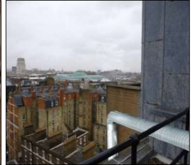
Close-up of proposed riser which discharges at roof level