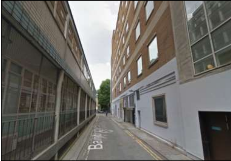
View from Bainbridge Street of proposed riser which will be utilised for the A3 ventilation

The riser will accommodate the kitchen extract. No physical alterations will be made to the existing arrangements. The riser runs internally throughout the building until the 6 th floor where the duct is fixed to the stair case wall. Cleanout doors will be installed internally at each floor, and provision made with tenants to enable the A3 occupier access for maintenance.