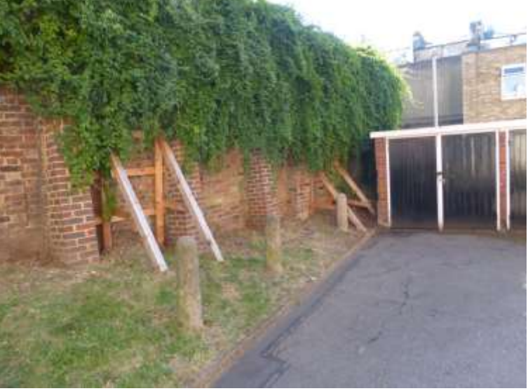
2. General View