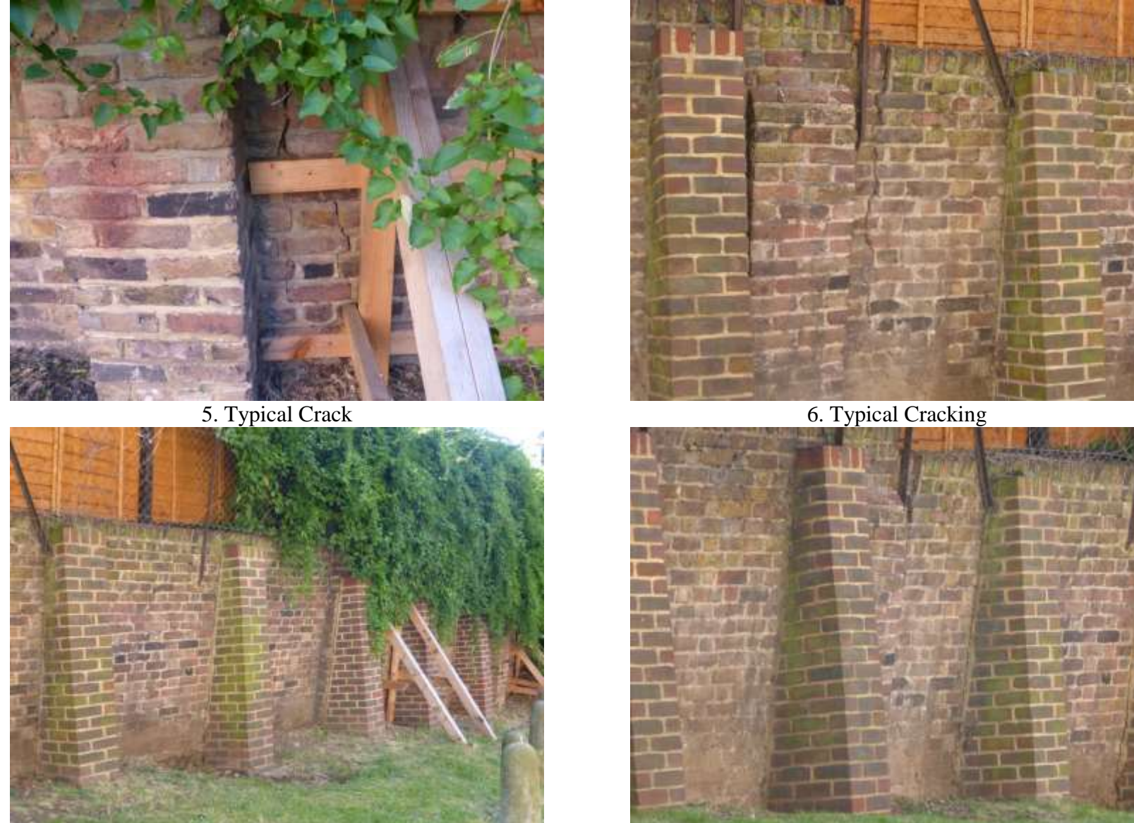
7. Illustration of Loss of Verticality