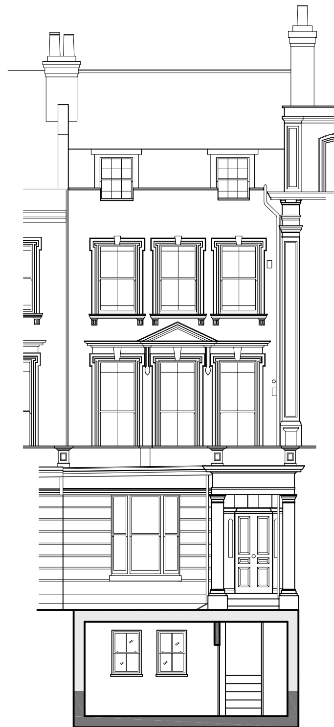
PROPOSED FRONT ELEVATION SECTION DD