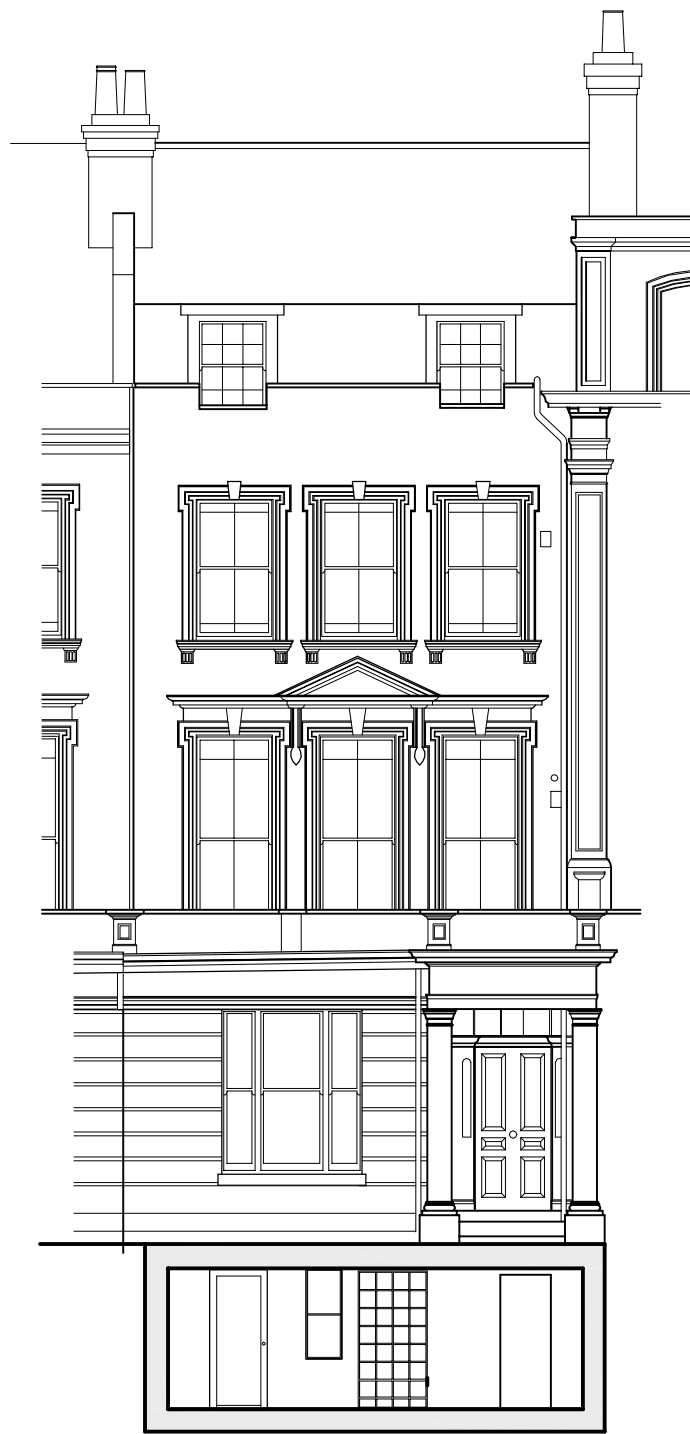
EXISTING FRONT ELEVATION SECTION DD