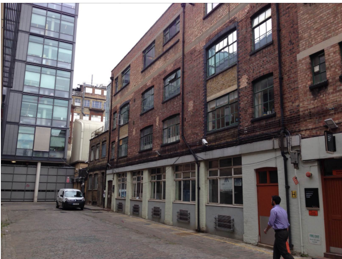
2. View towards 96A-98 Chenies Mews