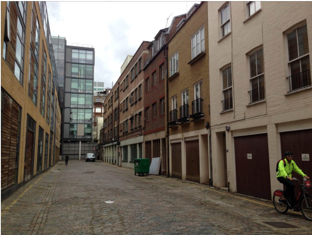
1. View look down Chenies Mews towards 96A-98 Chenies Mews