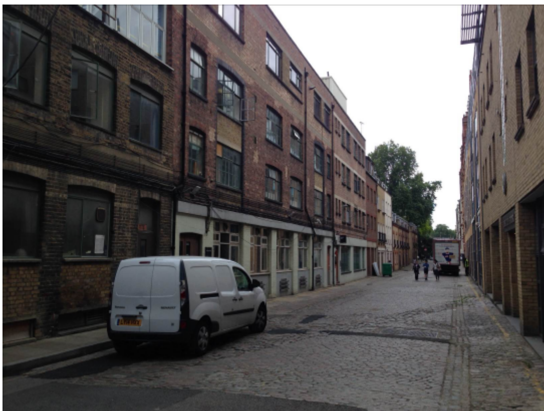
4. View looking south down Chenies Mews (96A-98 Chenies Mews is on immediate left of picture)