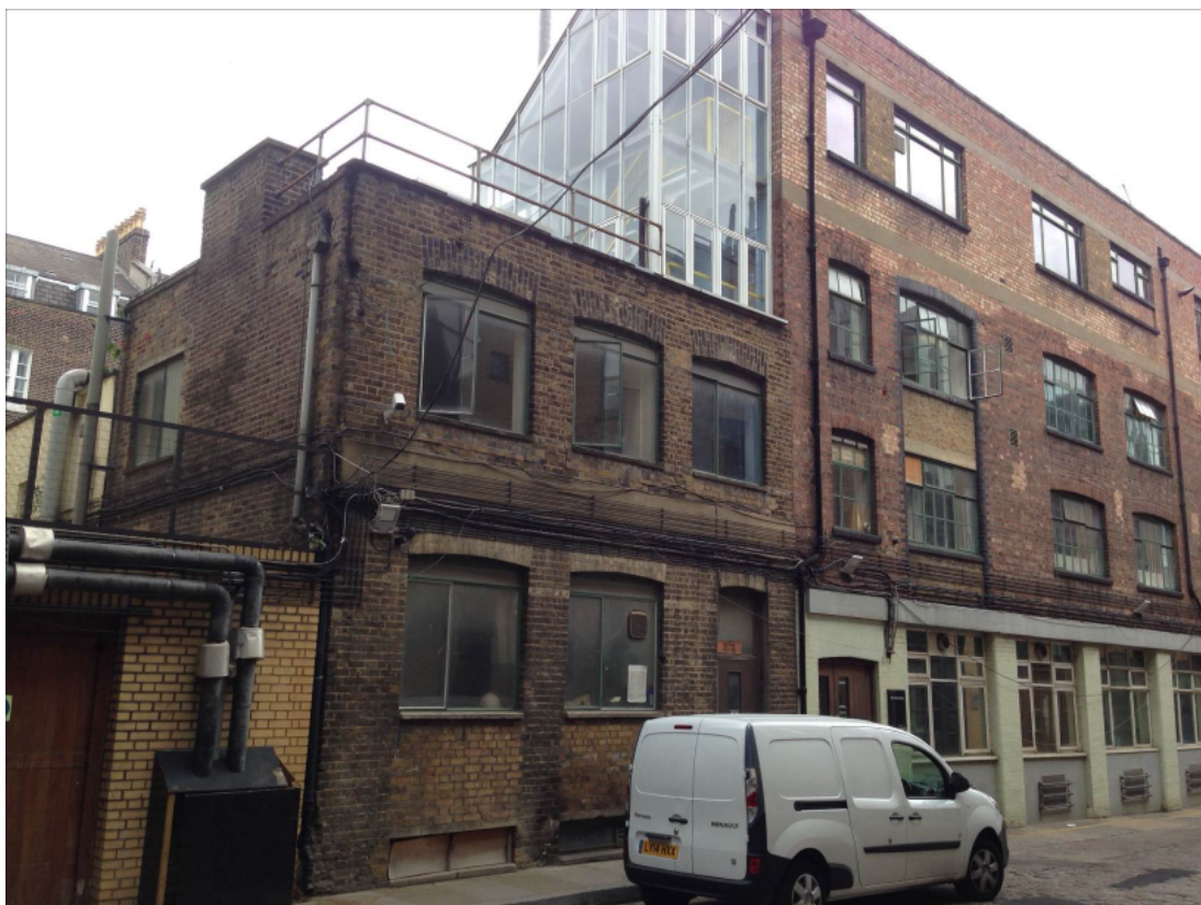
3. View of 96A-98 Chenies Mews