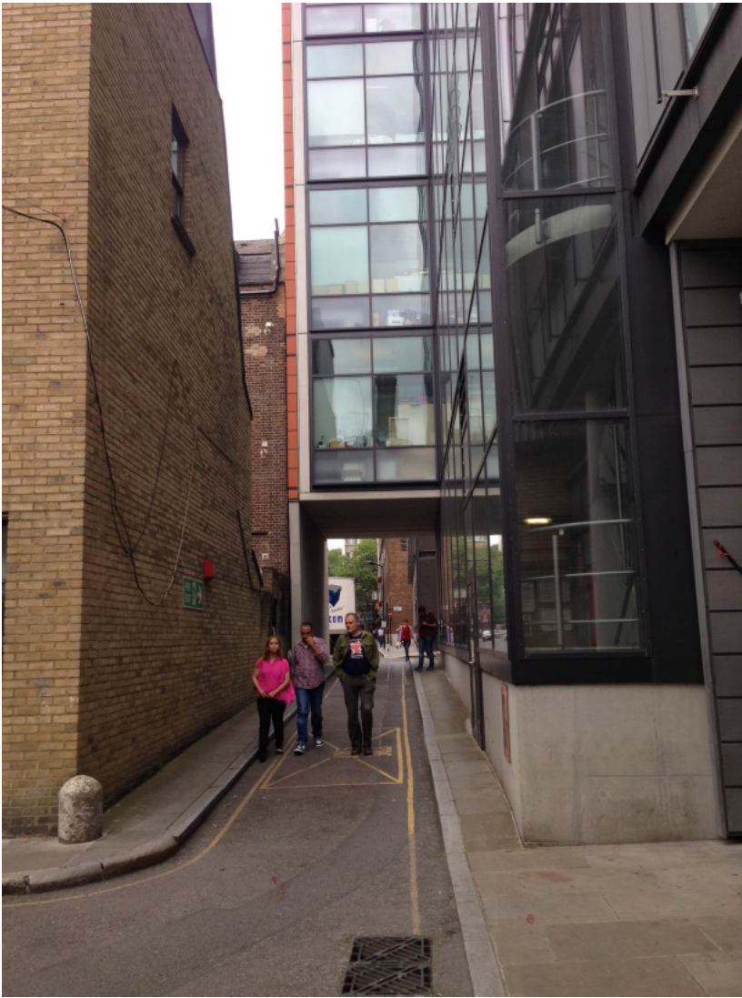
5. View looking along Chenies Mews towards junction with Huntley Street