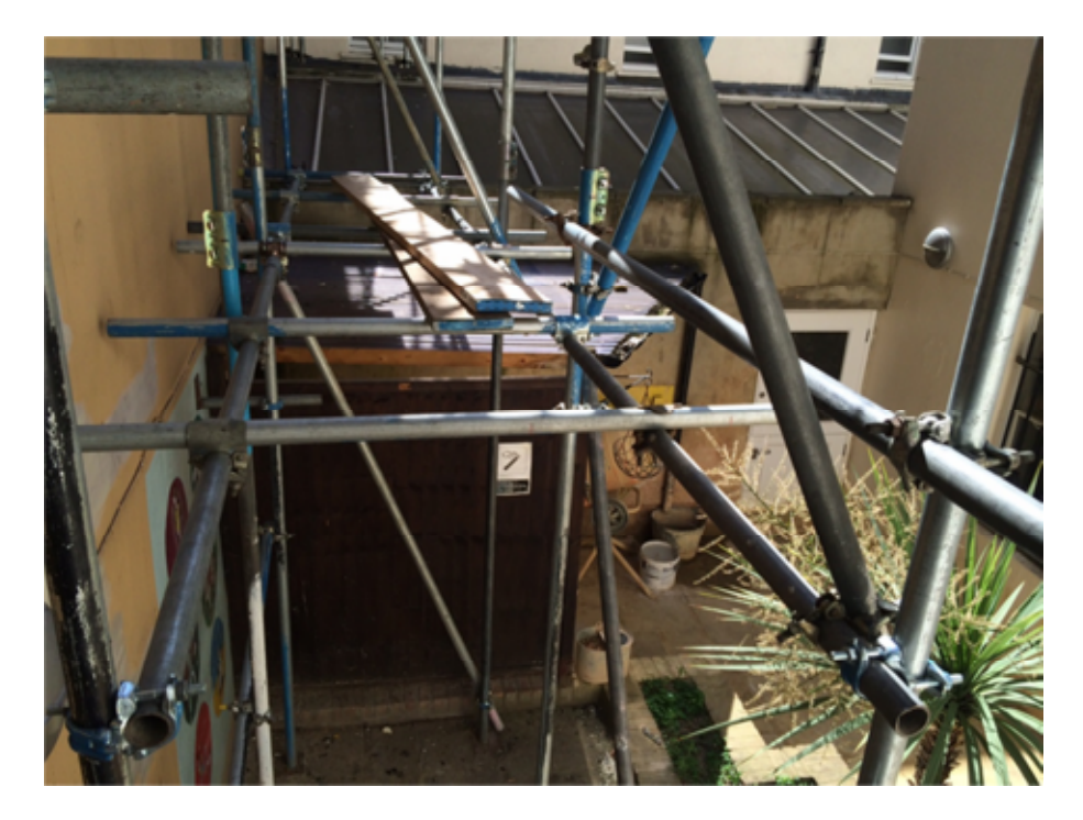
7. Photo of rear courtyard