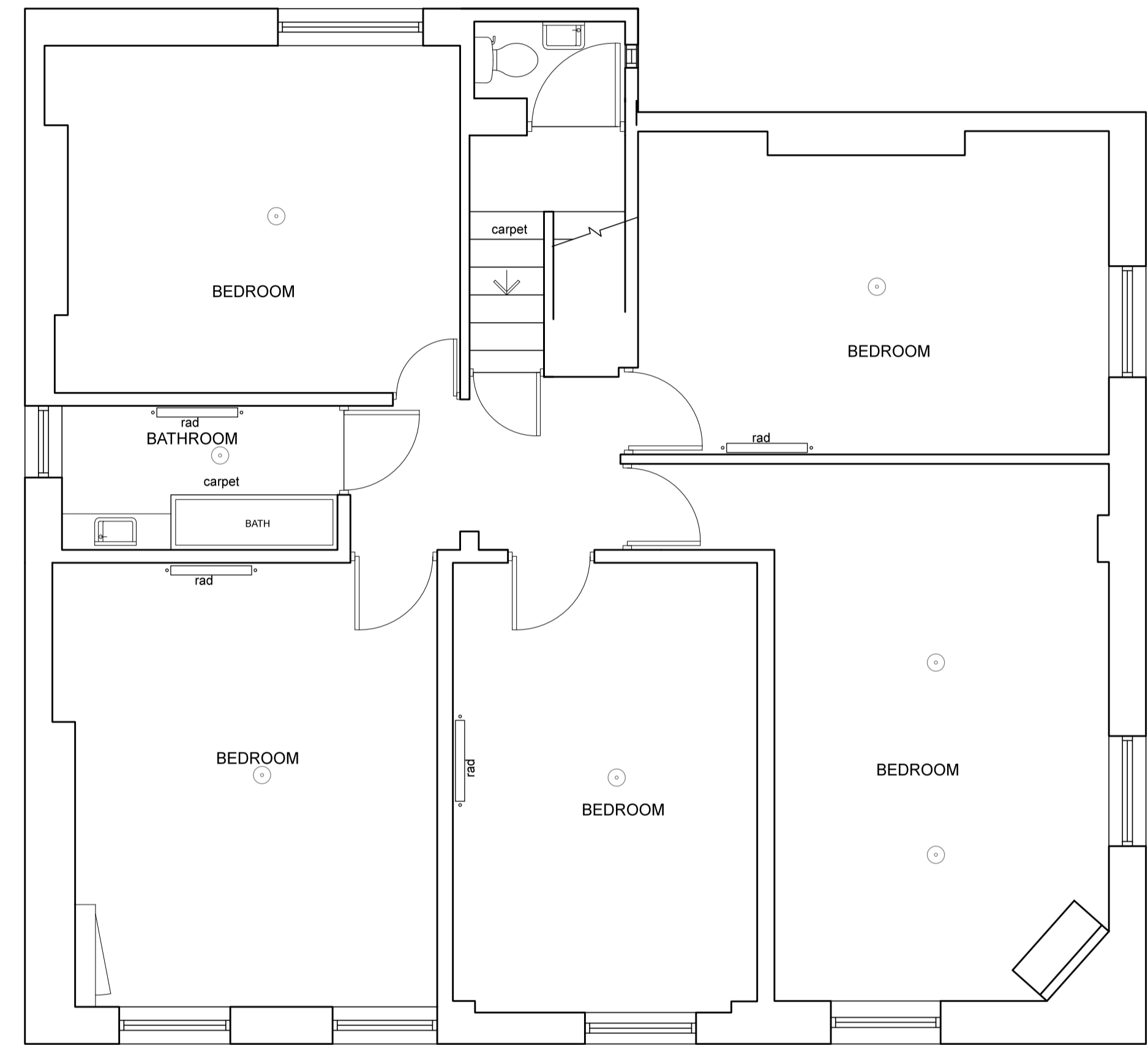
SECOND FLOOR PLAN - 1:50 @ A1