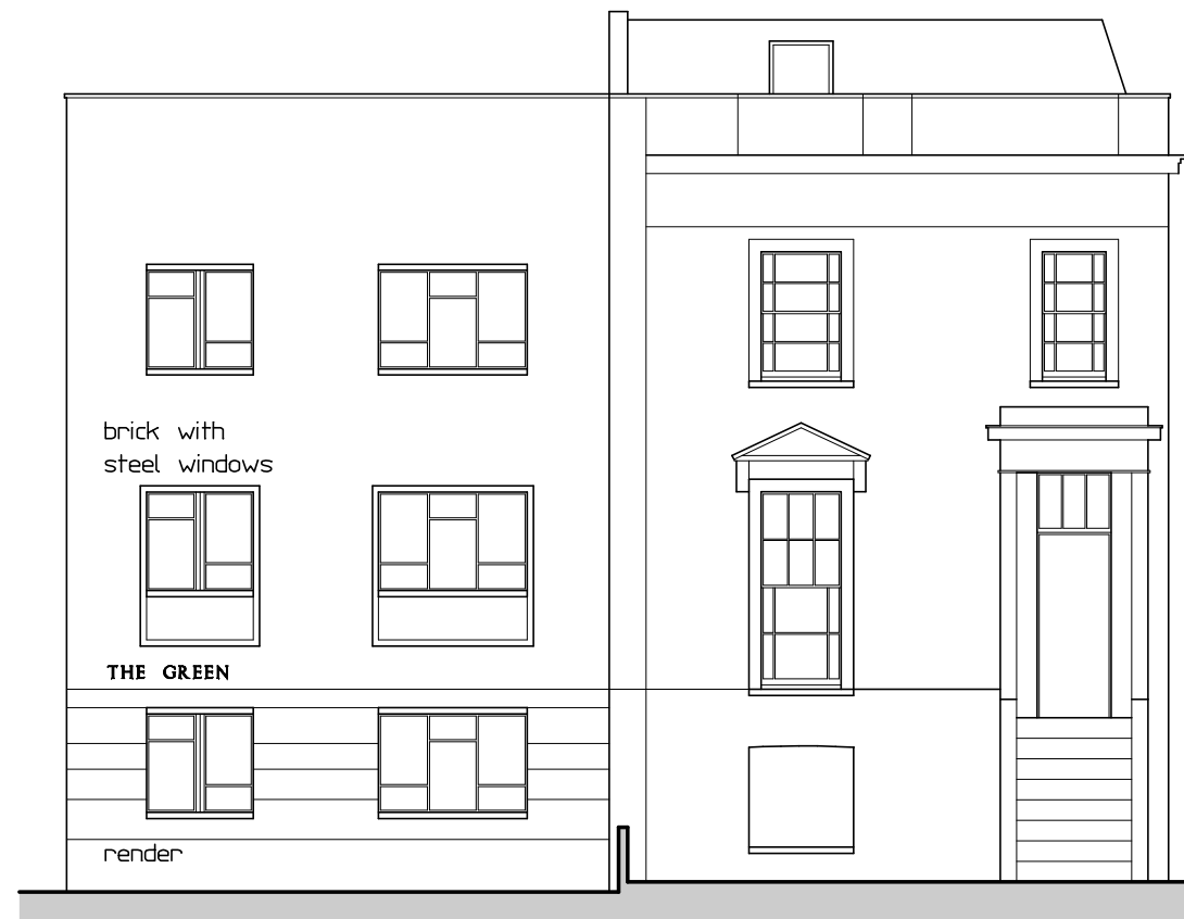
FRONT ELEVATION facing Rochester Terrace

PROJECT flat 6 THE GREEN Rochester Terrace, NW1 9JN