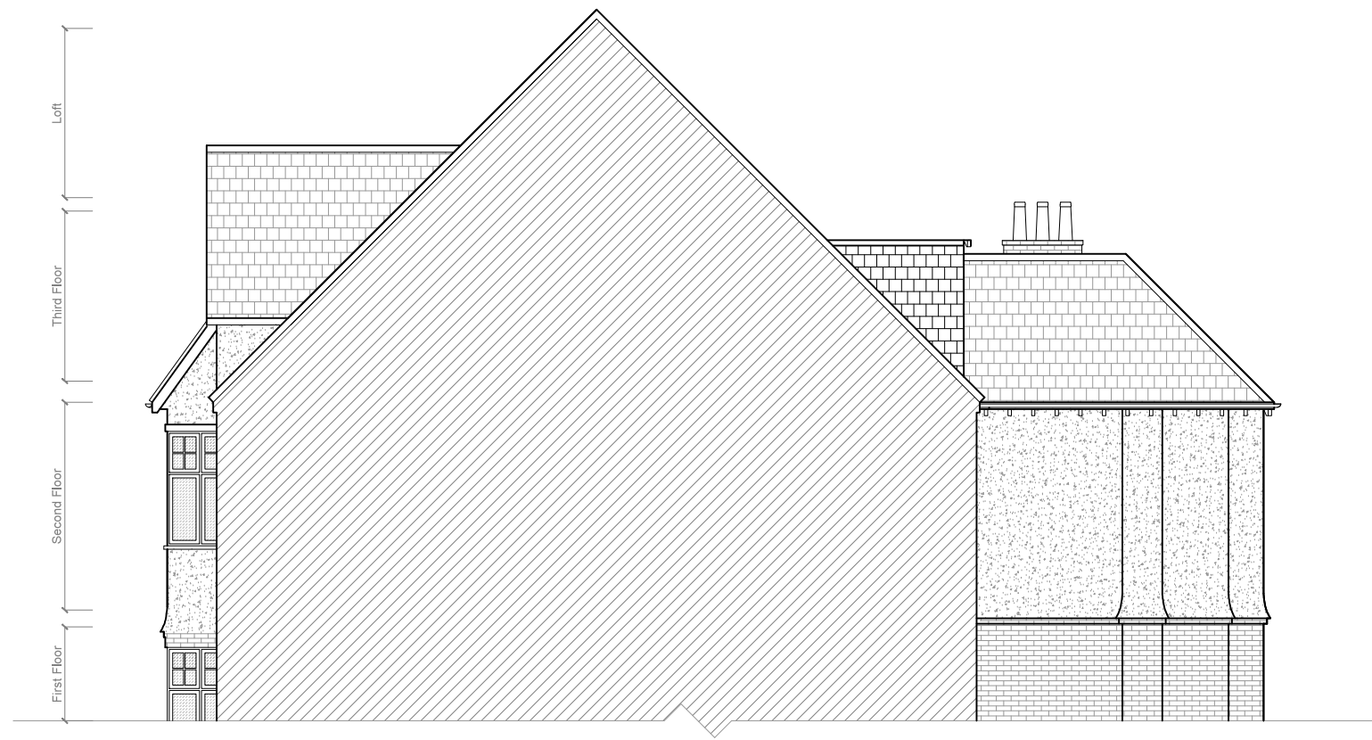
Side Elevation As Proposed