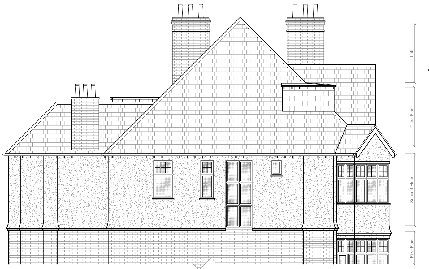
Side Elevation As Proposed