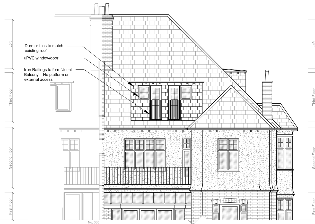
Rear Elevation As Proposed