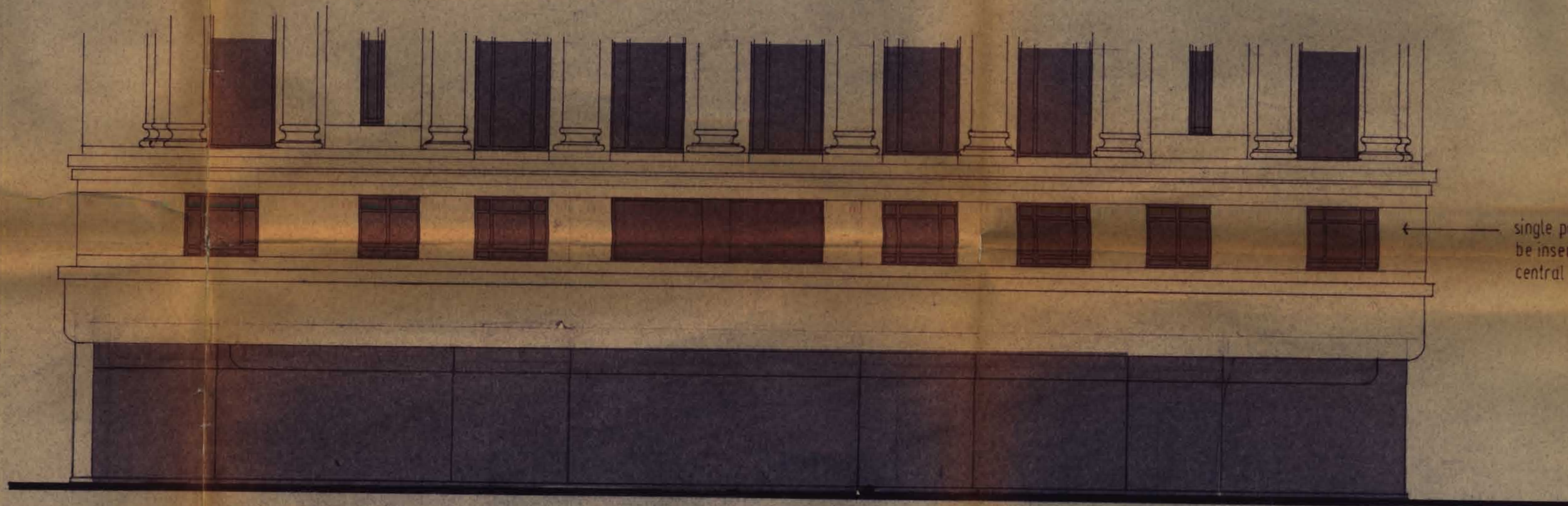
Elevation New Oxford Street