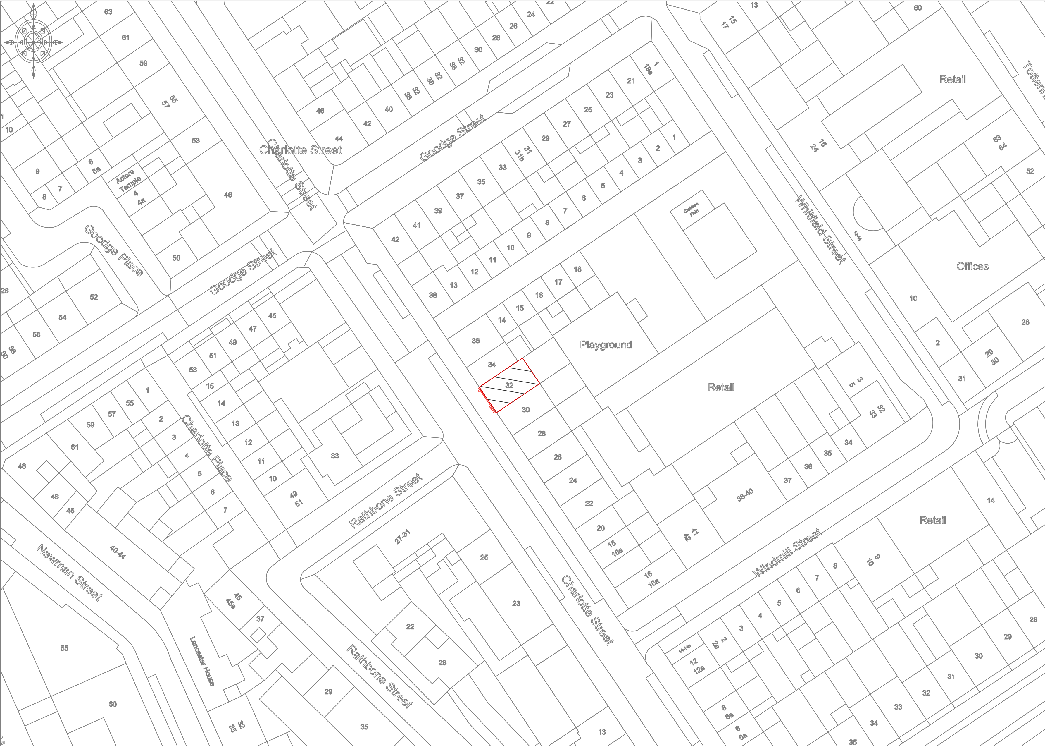
SITE LOCATION PLAN 1:500 @A1 0 10 20 30 40