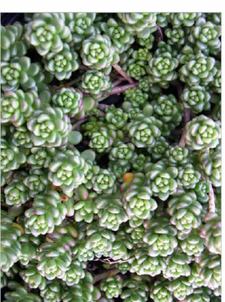
Sedum Album Athoum