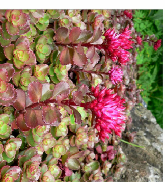
Sedum Spurium Purpureppich