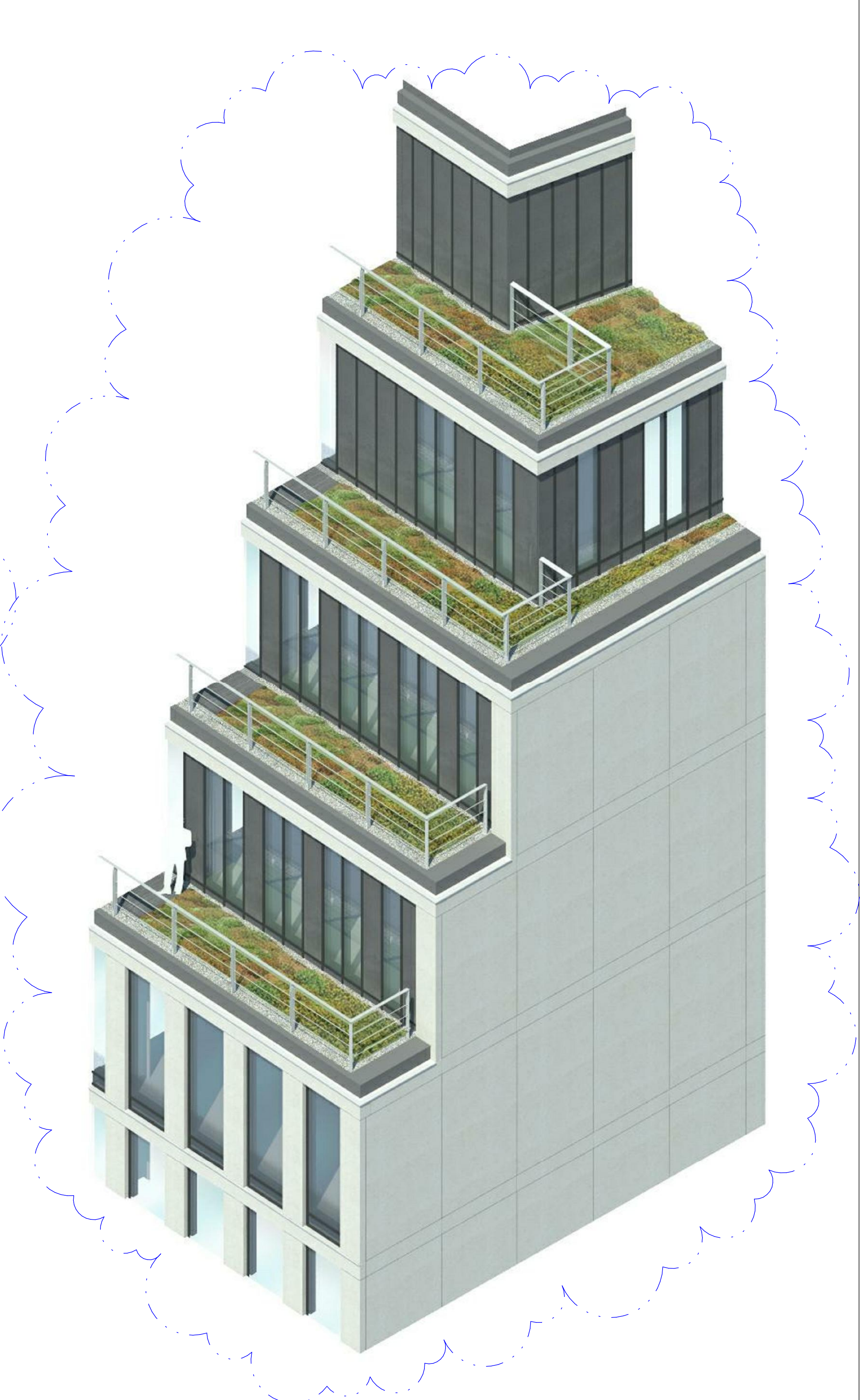
4 3D View Scale N.T.S.