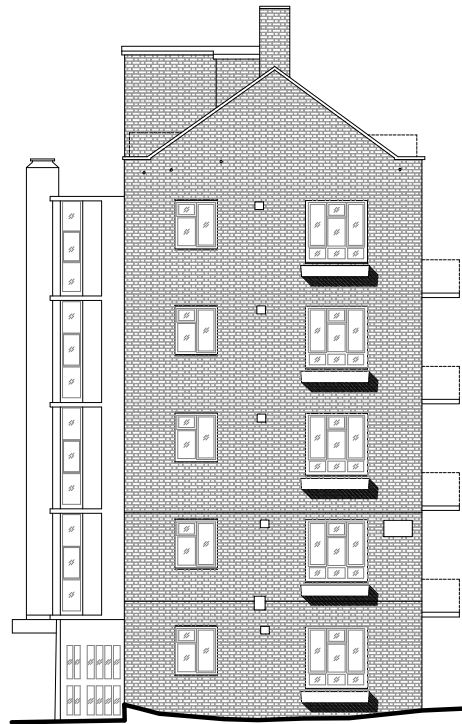
Elevation 2 (North)