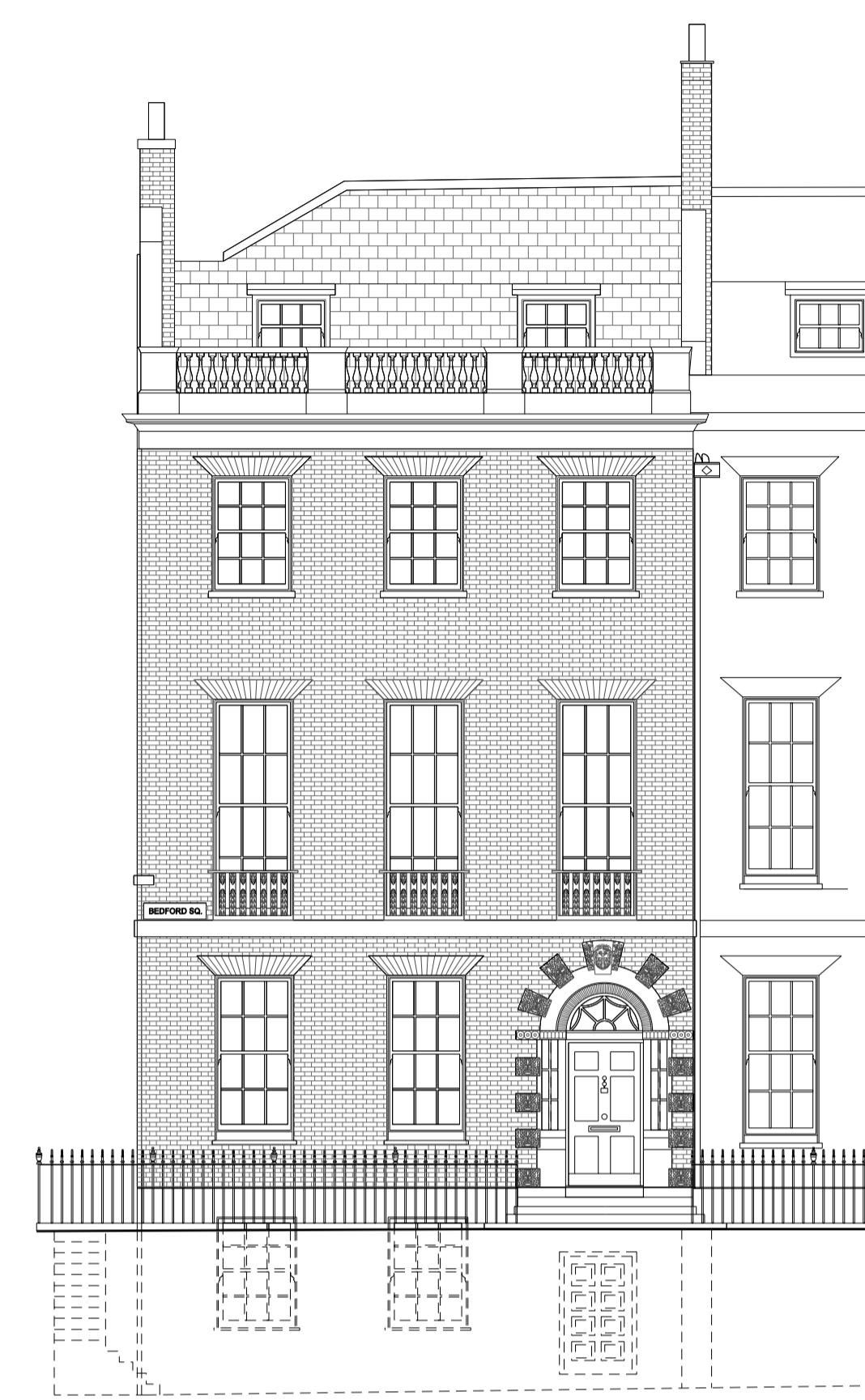
2 NORTH WEST ELEVATION scale 1:100