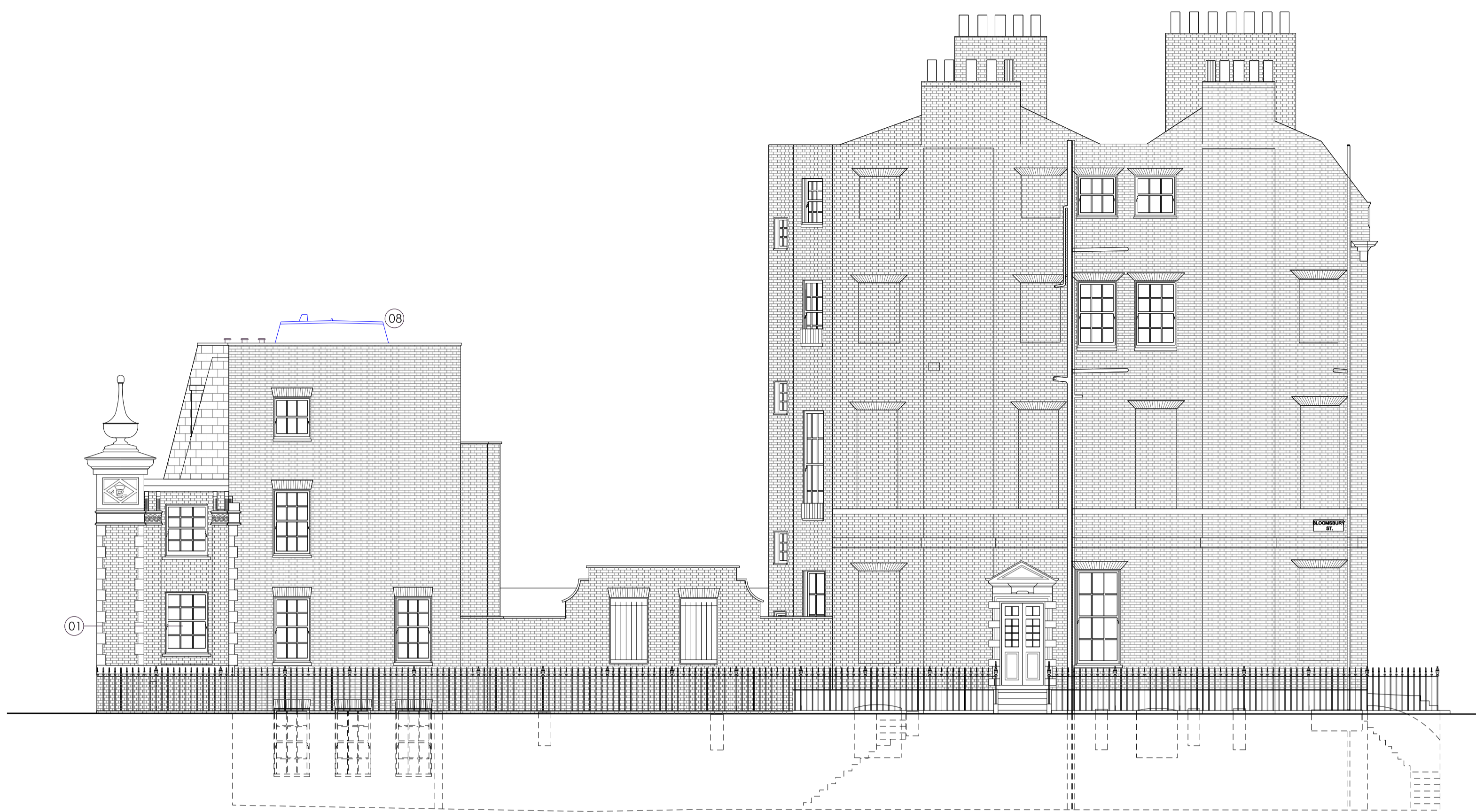
1 NORTH EAST ELEVATION scale 1:100