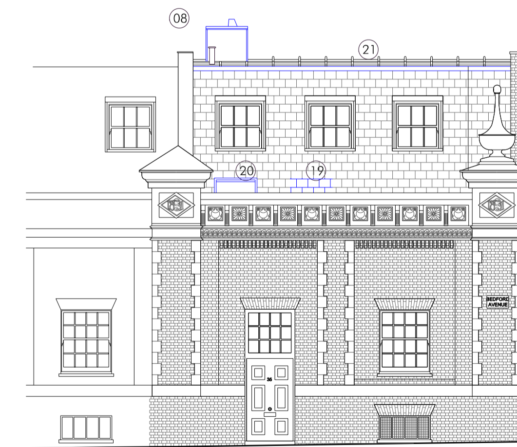
4 SOUTH EAST ELEVATION scale 1:100