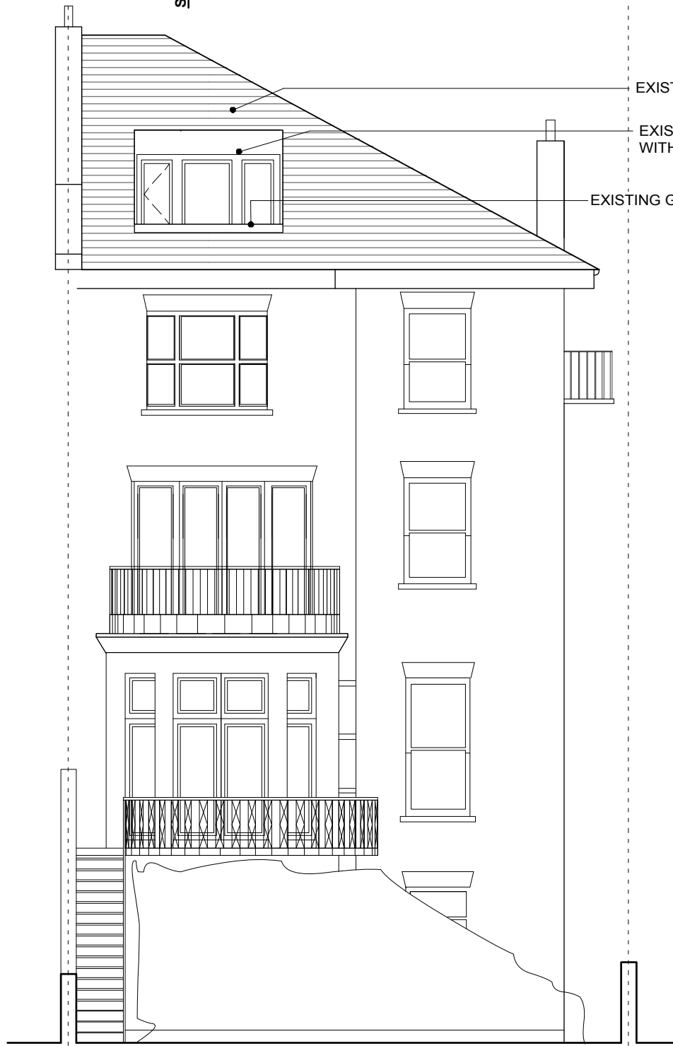
EXISTING REAR ELEVATION A Scale 1:100

This drawing is to be read in conjunction with all other contract documents, specifications and all other consultants drawings. All dimensions are to be checked on site before any work or shop drawings are commenced. This drawing is copyright. No drawing shall be reproduced in any form without prior written permission from Living in Space Ltd. Inform Living in Space of any discrepancies in this drawing before proceeding with works.