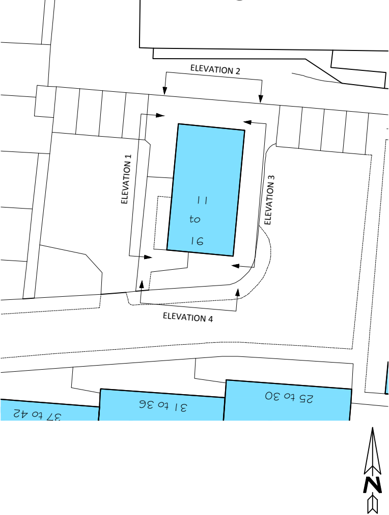
Block Plan (1:500 @ A3)