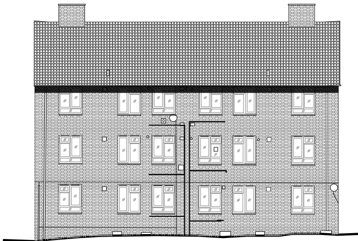
Elevation 3 (East)